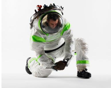
FIGURE 4 Z-2 suit design with luminescent patches.