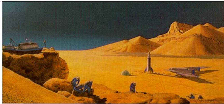
FIGURE 3 An illustration from Exploring Mars by Chesley Bonestell, 1956.

The major issues missing are the discussions of task-analytic data (a deficit shared by other NASA evidence reports) and discussion of an alternative to conventional EVA suit design. Additional gaps include discussions regarding the mechanisms for mitigating the effects of pressure-suit punctures and the effects of physiological deconditioning on human performance during EVAs in pressure suits. In the absence of task-analytic data, details are not available on the work that will be performed on the surfaces of asteroids and Mars; however, it is reasonable