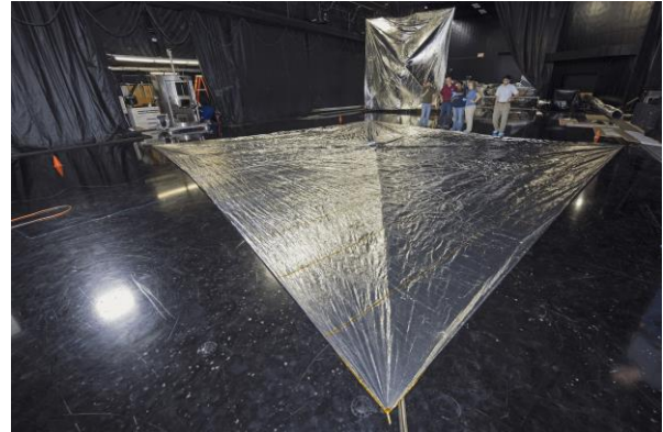
Figure 1. 86 square meter test sail deployed horizontally during a test at NASA MSFC. A half-scale sail hangs vertically in the background.

than 12 kilograms. NEA Scout will be launched on the first flight of the Space Launch System in 2018.