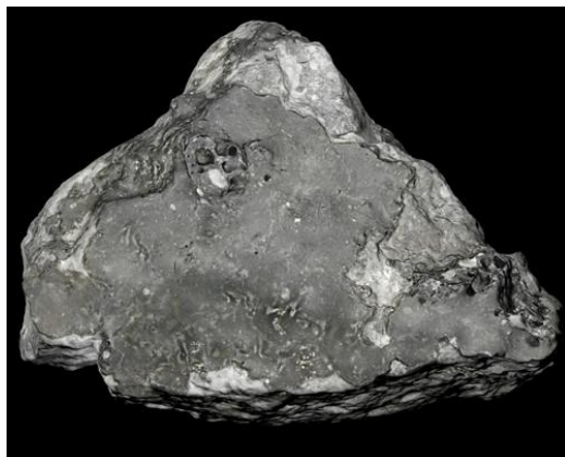
Orthographic render of the SFM-derived XZ face of Apollo Sample 60639 after registration to the XCT-derived isosurface model.

Through this data fusion process, we have designed a method to accurately visualize both external texture and internal composition data sets simultaneously.