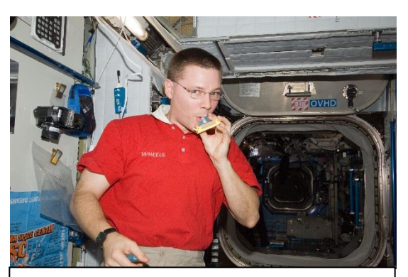
Figure 5. Astronaut Doug Wheelock collecting saliva sample during spaceflight operations.

In addition, Pierson and Mehta (5, 6) have studied latent herpes viruses in astronauts for nearly 20 years in spacecraft (Space Shuttle, Soyuz, Mir, and ISS). They found that EBV, VZV, and CMV reactivate and are shed in saliva (EBV, VZV) or urine (CMV) at levels that far exceed control subjects (9, 10). Figure 5 shows an image of saliva being collected during spaceflight saliva collection. The viruses remain latent until the immune system, specifically Tcell function, decreases to levels that can no longer control reactivation of the latent viruses.