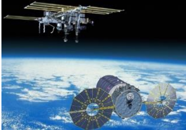
Orbital ATK Cygnus 2