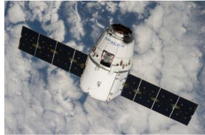
SpaceX Dragon 1