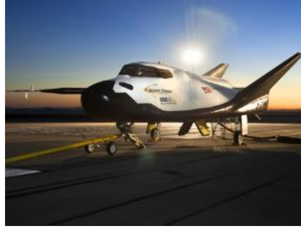
Sierra Nevada Dream Chaser