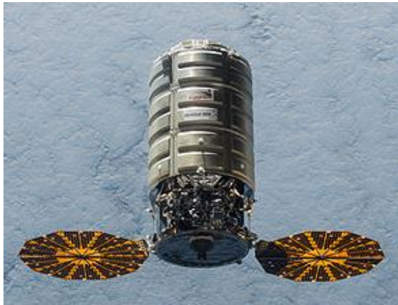
Orbital ATK Cygnus