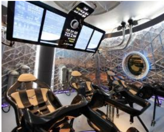
SpaceX Dragon 2 Crew and Cargo Variants