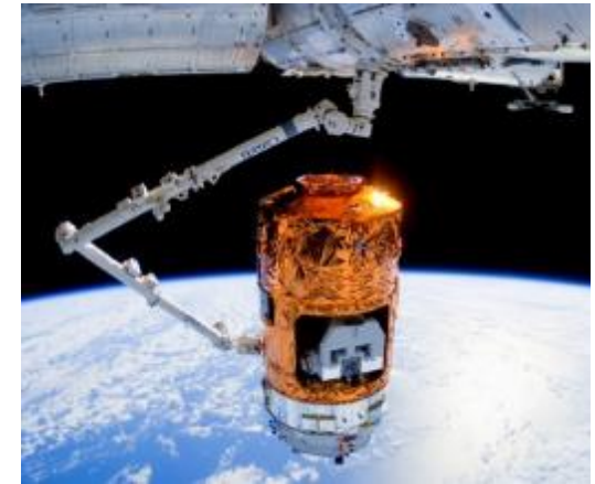
JAXA HII Transfer Vehicle