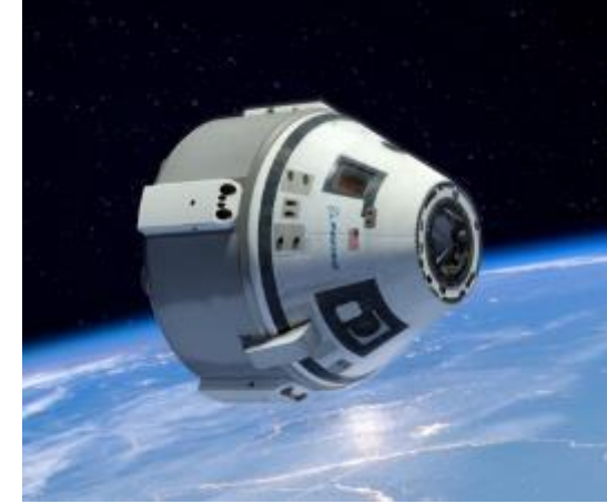
Boeing CST-100 Starliner