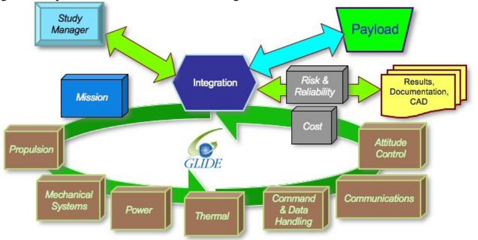
Figure 1. COMPASS team integration

team of discipline experts is key to developing and validating successful technical designs. Tools are a good start, but it is the people that make the team successful. Figure 1 captures the essence that the COMPASS team is made up of experts who are matrixed in from discipline organizations, and it also depicts the interaction of the different disciplines throughout the process, which is facilitated using the tools in the COMPASS lab.