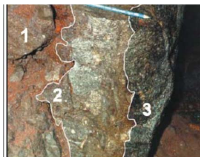
Figure 1: The Ape Cave lava tube, as shown in Williams et al., 2004. “1” represents the pre-flow sediments fused by the heat of the forming tube; “2” and “3” show the wall of the Ape Cave lava tube that indicate thermal erosion has occurred in the tube. This study looks for similar signatures at the December 1974 flow, HI.

Ape Cave Chemical Assimilation Study: The one case where chemical assimilation was documented was in the Cave Basalt lava tube system near Mout St. Helens, WA, in Ape Cave [11]. In this study, Williams et al. collected samples from several locations throughout Ape Cave lava tube. Field evidence (Fig. 1) shows evidence of chemical assimilation in pre-flow sediments in the wall of Ape Cave and chemical analyses document that erosion occurred in areas near the vent and in steeper sections of the tube. These laboratory analysis demonstrate that it is possible to document chemical assimilation in volcanic systems. However, this assimilation process has not yet been documented in open surface channels in terrains and flow-types like what are seen on other planetary surfaces. This study documents the first example of chemical assimilation in a terrestrial