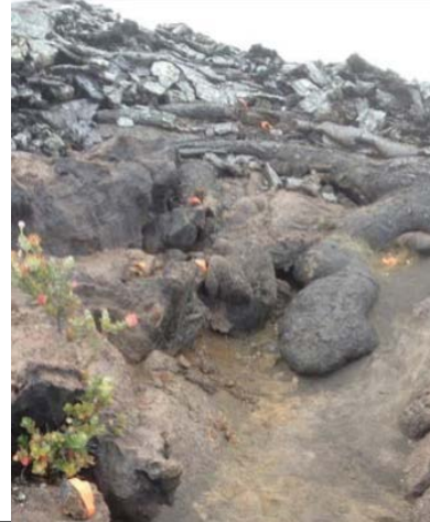
Figure 3: Field photo of an analyzed tumulus at the D1974 flow. In situ hXRF measurements were taken from the D1974 flow across the contact into the older flow. Table 1: In situ hXRF measurements show assimilation between the younger D1974 flow and the older, redder flow for four key elements.

Chemical Assimilation at the D1974 Flow: In order to determine if any chemical assimilation occurred between the D1974 flow and the older flow, we sampled a tumulus (Figure 3) where the D1974 flow is in direct contact of an island of the older flow. Several hXRF analyses were performed at the feature shown in Figure 3. The measurement strategy involved analyzing basalt from the older flow ~1m from the D1974 flow, at the contact between the flows, and in the D1974 flow itself. Table 1 show data from four key elements, which we interpret as evidence that chemical assimilation has occurred between the two flows. These data show both that it is probable that the chemical interactions between the two flows occurred and that it is possible to detect this relationship with field portable technology.