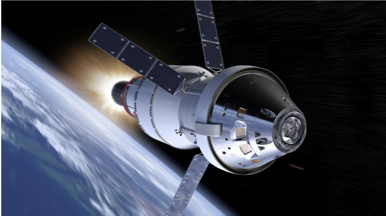
Figure 1. Orion Multi-Purpose Crew Vehicle (MPCV)

The ammonia boiler system is part the Orion spacecraft's Active Thermal Control System (ATCS), one of seven subsystems that make up the spacecraft's Environmental Controls and Life Support Systems (ECLSS). The purpose of the ATCS is to reject excess heat loads produced by the crew and avionics. Excessive heat loads can lead to damage of the spacecraft's electronics and produce an uncomfortable working and living environment for the crew. The ATCS is comprised of heat transport loops, radiators, and supplemental cooling devices that work in conjunction to keep the spacecraft sufficiently cooled. The ammonia boiler system is a supplemental cooling device that works by evaporating ammonia in a heat exchanger that provides coolant fluid to the spacecraft. The system utilizes the low boiling point of ammonia to reject heat from the coolant loops as they pass through the heat exchangers, maintaining temperature control.