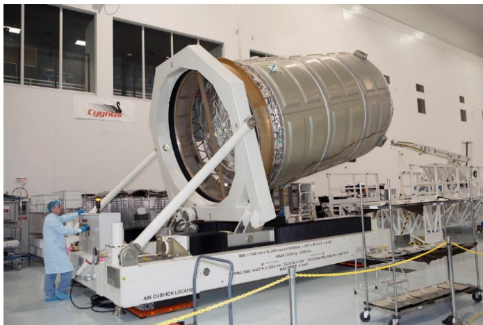
Figure 4. OA-7 Cygnus Capsule, SSPF

The author had the opportunity to participate in two exciting learning opportunities in addition to working on this project. The first was a tour of the high bay located inside the Space Station Processing Facility (SSPF). While touring this facility, Orbital ATK’s OA-7 Cygnus cargo delivery spacecraft was being prepped for its upcoming resupply mission to the International Space Station (ISS). The author will have the opportunity to watch the launch of this spacecraft on top of an Atlas V rocket from Cape Canaveral in April.