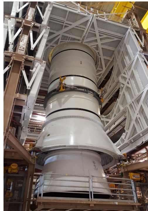
Figure 5. Aft Skirt SRB Segment, RPSF

The author also had the opportunity to tour the Rotation, Processing and Surge Facility (RPSF). The RPSF is the facility where the solid rocket booster (SRB) segments are received by rail car, transitioned to the vertical position by crane, and stacked before making the trip across the street to the Vehicle Assembly Building (VAB). Upon arrival to the VAB, the SRBs will be joined to the Space Launch System (SLS) and bolted to the crawler transporter platform. The SRBs that will be used as part of the SLS contain 1.5 million pounds of propellant each. The author is an active member of several undergraduate research projects involving composite solid rocket propellant, so this was an incredible experience for her.