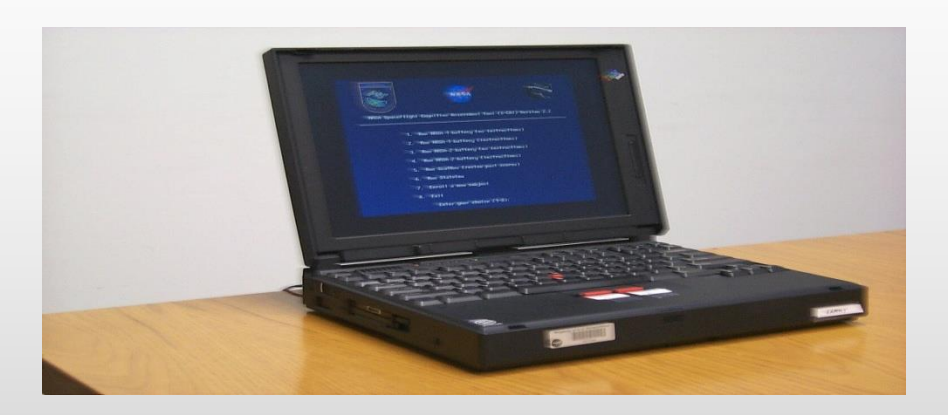
Neurocognitive Assessment with WinSCAT

WinSCAT is a brief neurocognitive test that provides a baseline level of cognition. This baseline can be used following a neurological injury on the ISS to judge severity and gage recovery