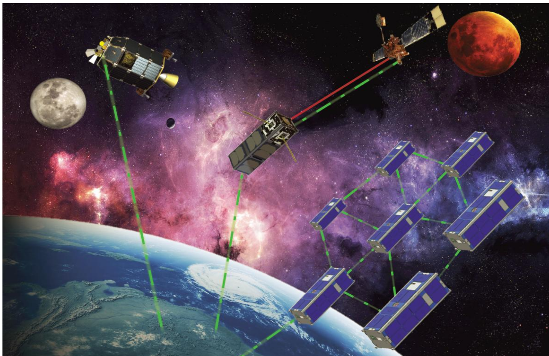
Figure 1. Laser Communications Rendering.

Laser-based communication technology has been used on Earth, primarily using fiber optic cables buried underground or in channels at the bottom of the sea. The same needs for more data faster has led NASA and others to investigate using lasers to communicate through space. The more data that can be sent back to Earth from NASA's missions, the more cost-effective and scientifically valuable they can be. Since laser light wavelengths are shorter than radio waves, laser energy spreads out less as it travels through space, thus allowing faster communication rates,