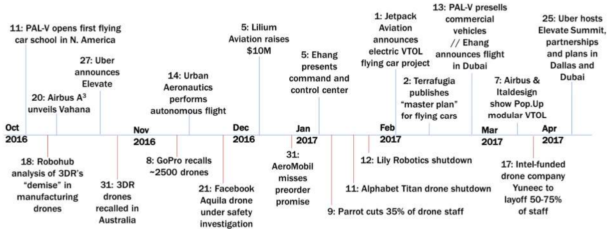
Figure 2: Timeline of public drone industry actions occurring between October 2016 and April 2017

In terms of when consumers in the United States could expect to see these technologies, such prognostications are difficult when technologies are rapidly developing. Conventional air taxis can be seen today as evidenced by services such as FlyOtto, which uses the network model to match potential customers with private charter operators (Part 135 certified) in general aviation aircraft. However, this concept for on-demand mobility must gain public acceptance as a viable option, and costs for such operations currently limit widespread market appeal.