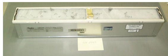
Figure 1. An ISS Bacteria Filter Element. Each filter element weighs 2.6 kg and occupies 7.3 liters.

A model of filters in a series arrangement is used to determine the overall capturing efficiency of a multi-stage filtration system. Figure 2 shows how the first filter component captures some of the incoming particle load and allows the remaining load fraction to pass to the next stage. Successive stages capture different particle size fractions to yield the overall filtration performance.