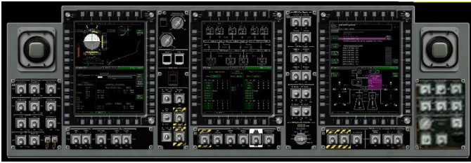
Figure 2. Example of the three Orion cockpit displays [5].

Click(Image:"Internet_Browser_Icon", waitfor:5) Click(Image:"Internet_Address_Bar", waitfor:5) TypeText "www.nasa.gov" Wait(5) // Wait for website to load If ImageFound(Image:"NASA_Logo", waitfor:5) then LogSuccess "Found NASA Logo!" Else LogError "NASA Logo not found." End if