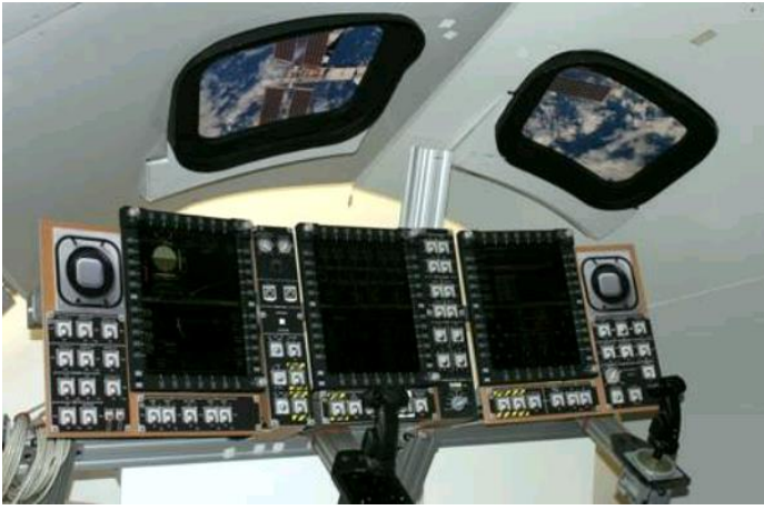
Figure 1. Mock-up of glass cockpit displays [3].