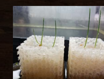
Plant growth in 3D printed blocks of biologically derived filament