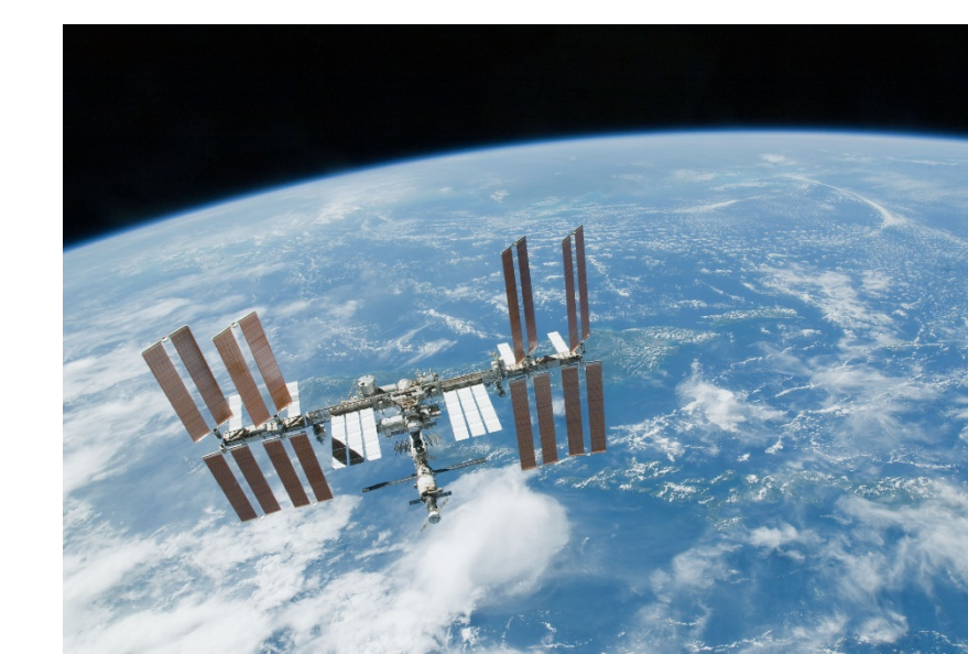
ISS: The Proving Ground for Space-Based Manufacturing Technologies