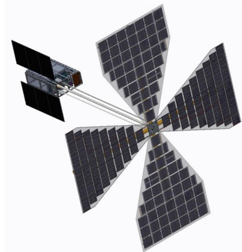
Fig. 4. The planar LISA-T configuration is shown deployed from a 6U CubeSat during flight.

NASA is studying a potential Earth-orbital flight demonstration of the LISA-T in 2019 or 2020. The demo would consist of a CubeSat Class 1U power and antenna module attached to a 6U spacecraft bus. The current plan would have an 180W planar array built from both low cost and high performance solar cell packed in the 1U power module and deployed once the CubeSat is in low Earth orbit. An artist concept of the deployed LISA-T system in flight can be seen in Fig. 4. Because >99% of the hardware is shared between the planar and omnidirectional configurations, this demonstration will also show feasibility for the non-pointed, omnidirectional array. Both S- and X-band helical antennas will be integrated. The LISA-T antenna structure would demonstrate a deployable, multiple band system with low mass and volume. The demonstration will show feasibility for both high power and spherical coverage communications. It should be noted that several companies have expressed interest in the capabilities to be provided by LISA-T and NASA is currently negotiating a licensing agreement with one.