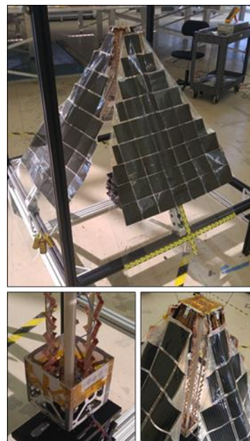
Fig. 2 The LISA-T arrays deployed in the omnidirectional configuration in TRL-5 testing.

Both configurations have been tested through Technology Readiness Level (TRL) 6 at the NASA George C. Marshall Space Flight Center. Ambient and thermal vacuum stowage and deployments tests have been conducted on both configurations and elements thereof. Fig. 2 shows the TRL5 omnidirectional prototype: a 60W array based on the low cost cell option. Further details on the array architecture and its evolution are published elsewhere. [9]