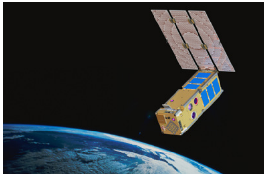
ISARA Spacecraft Configuration with 3U CubeSat and Solar Array with Integrated Reflectarray Antenna

The ISARA technology will be validated in space during a five-month mission to measure key reflectarray antenna characteristics, which include how much power can actually be obtained over its field of view. ISARA contains a transmitter and an avionics subsystem that features a Global Positioning System (GPS) receiver and a high precision attitude control system designed to orient the CubeSat to enable accurate antenna beam pointing. Once in orbit, ISARA will deploy its solar array