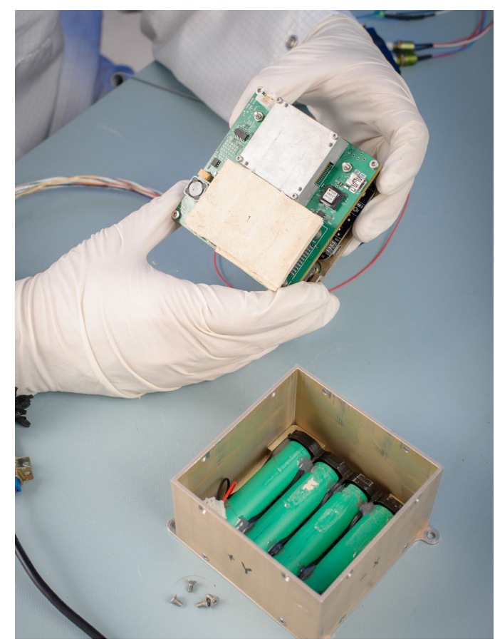
AVA controller is smaller than a stack of 6 compact disc cases, and weighs in at under a kilogram—batteries included!

The GCD Program investigates ideas and approaches that could solve significant technological problems and revolutionize future space endeavors. GCD projects develop