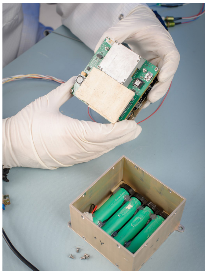
AVA controller is smaller than a stack of 6 compact disc cases, and weighs in at under a kilogram—batteries included!

The GCD Program investigates ideas and approaches that could solve significant technological problems and revolutionize future space endeavors. GCD projects develop