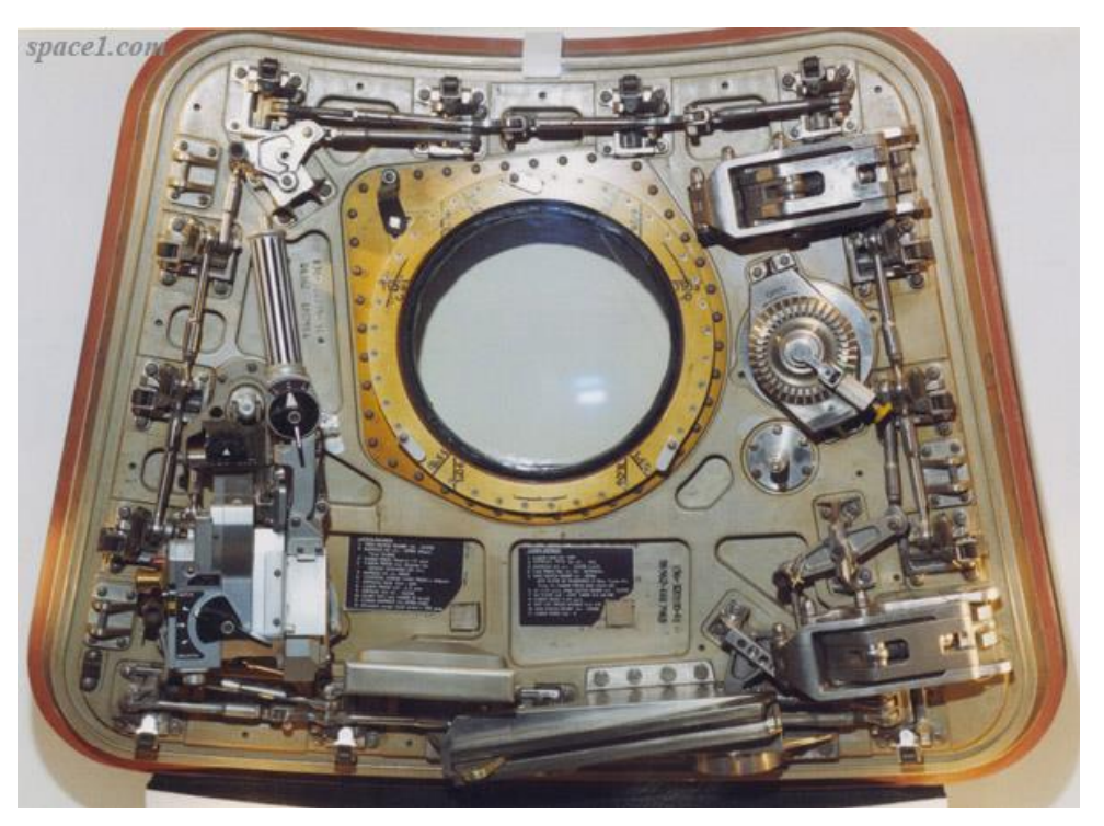
Figure 1: Apollo Command Module Side Hatch – View Looking Out

The Orion CMSH draws a significant amount of heritage from the Apollo Command Module Side Hatch. They share a similar trapezoidal shape, perimeter mechanical latches and twin double four-bar hinges.