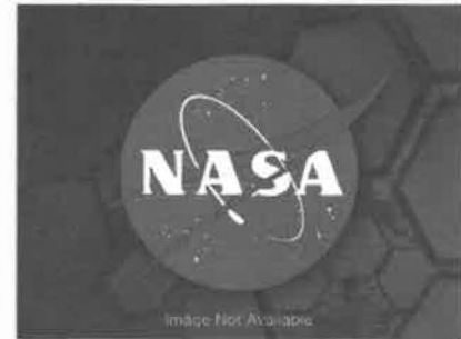
Water Use and Requirements of PtFT1 Plums for Long Duration Space Missions

The project will advance both technical and scientific knowledge on the production of PtFT1 dwarf plums and provide approach for the management of soil moisture content in microgravity. This will be achieved by determining the baseline water demands of the candidate plum lines (NASA 5, NASA 10, NASA 11 and NASA 12), determining the optimal range of soil moisture contents, and establishing feedback irrigation system based on plant water demand. Off the shelf soil moisture probes will be used to monitor root moisture conditions and integrated into an irrigation control system. This technology has wide application to near and long-term space flight experiment with plants, as well as direct applicability to terrestrial horticulture industry.