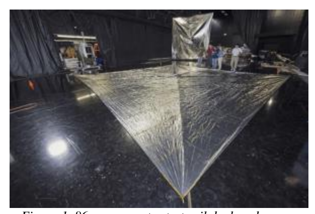
Figure 1. 86 square meter test sail deployed horizontally during a test at NASA MSFC. A half-scale sail hangs vertically in the background.

and science destinations.[2] The NEA Scout mission, funded by NASA's Advanced Exploration Systems Program and managed by NASA Marshall Space Flight Center (MSFC), will use the solar sail as its primary propulsion system, allowing it to survey and image a NEA of interest for possible future human exploration. Given the constraints intrinsic to a CubeSat form factor, folding methodologies had to be devised to maximize the sail size for the available volume thereby minimizing time of flight requirements. Benchtop and full scale engineering unit testing (Figure 1) helped further mature the design and demonstrate its ability to meet mission requirements. NEA Scout utilizes an 86 m<sup>2</sup> solar sailand will weigh less than 14 kilograms at launch. Fabrication of the flight unit has begun in preparation for launch on the first flight of the Space Launch System in 2018.