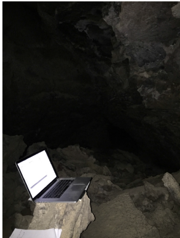
Figure 4. Laptop location for Tests 13 and 14.

The experiment also showed that complicated cave geometry and obstructions does not necessarily prevent high rate of data transfer; however, the data rate is reduced if obstructions are present. Double obstructions proved problematic for establishing any communication. Further analysis of the electric field properties is required to understand how various geometry features affect the link quality and to develop an advanced protocol to mitigate the communication challenges in the presence of complicated geometry that obstructs the signal.