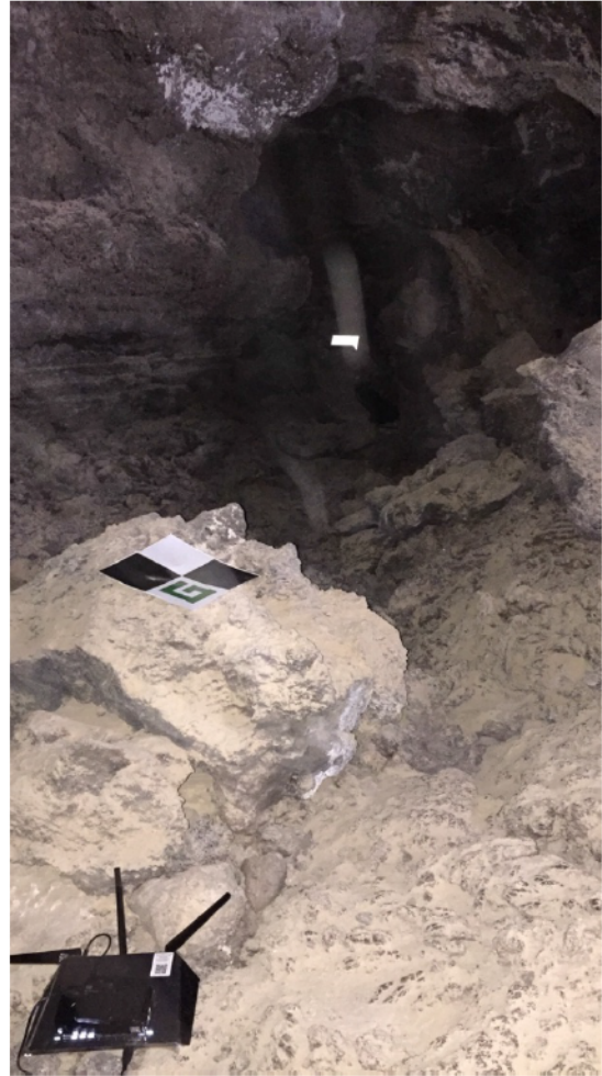
Figure 2. Test 10 setup.

The results of the test are provided in the Table 1, while the laptop location is shown in Figure 4.