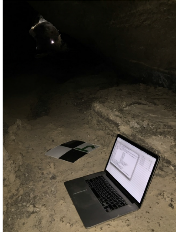
Figure 3. Laptop location for Test 11 (left) and Test 12 (right).