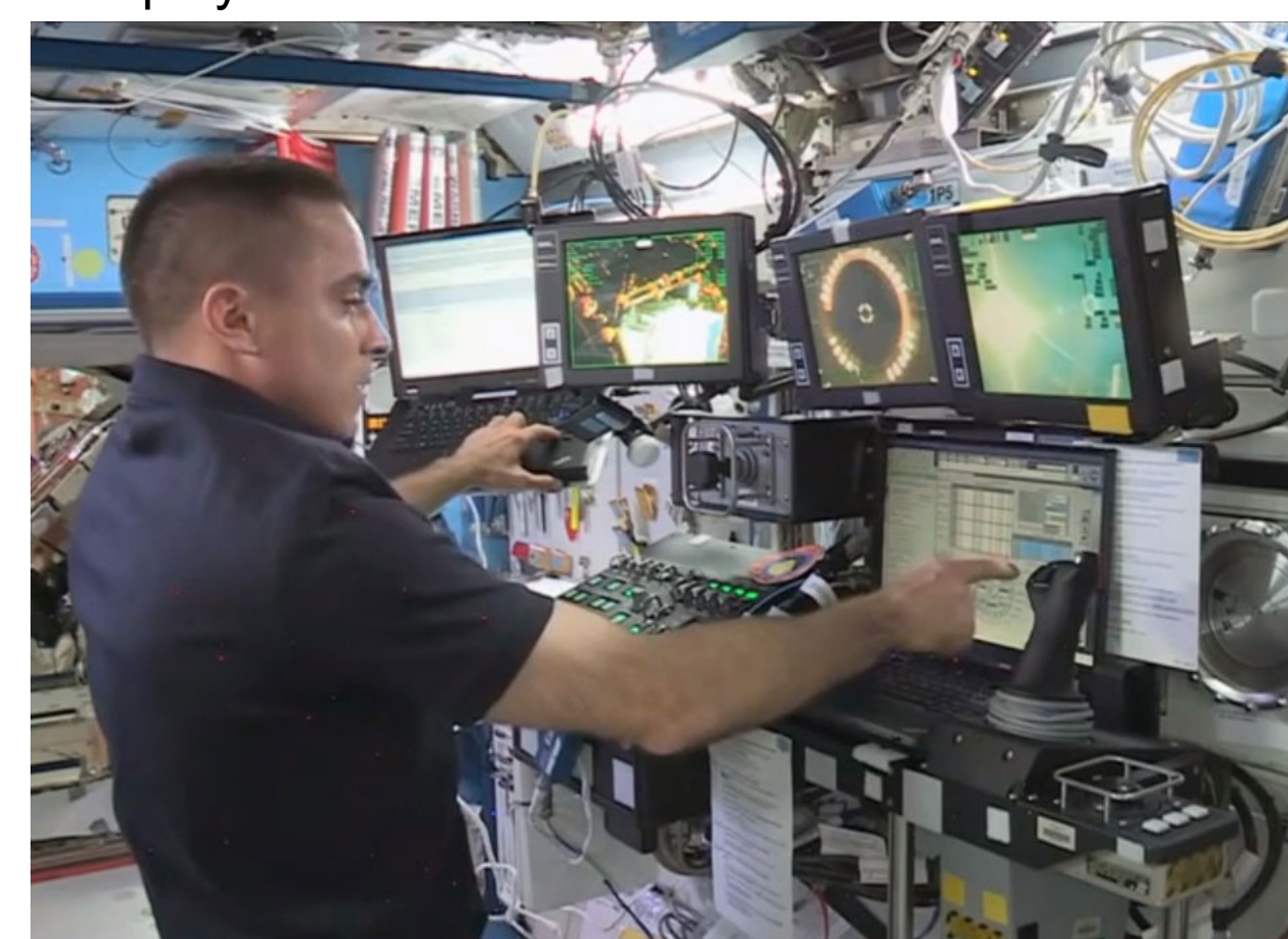
H-II Transfer Vehicle (HTV)-4 Capture and Berthing: Robotics Ground Controllers powered up the Space Station Remote Manipulator System (SSRMS), August 2013