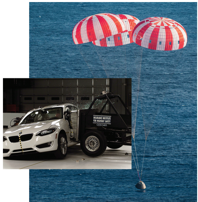
Orion video requirement advances high-speed, compact cameras.

Under a NASA contract, Integrated Design Technologies developed a rugged, compact, high-speed video camera with ultra-fast solid-state memory to record parachute deployment during a test flight of the Orion spacecraft. The camera captured 1,000 frames per second, backing up 12 gigabits of data per second as it filmed. Today, a commercialized version of the technology is being used in automobile crash-testing and in filming slow-motion sequences for television. [2]