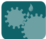
Mechanical and Fluid Systems