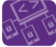
IT and Software