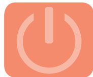
Power Generation and Storage