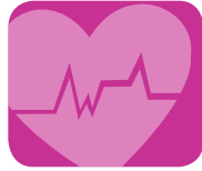
Health, Medicine, and Biotechnology