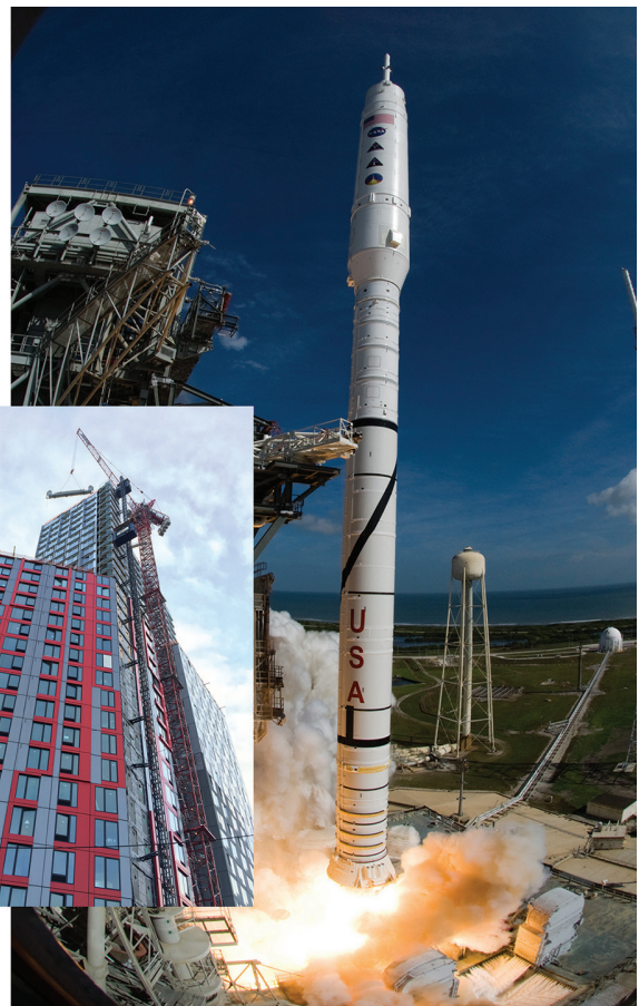
Rocket technology counteracts vibrations.

Over the course of more than 40 Small Business Innovation Research (SBIR) contracts since the 1980s, many with Glenn Research Center, NASA has helped Pennsylvania-based Thermacore advance the technology of heat pipes, a tool used to move heat so it can dissipate safely. In the last decade, the NASA-improved heat pipes have been adapted to medical uses, including bipolar forceps utilized in brain surgery. [5]