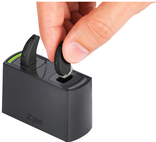
Rechargeable hearing aid batteries draw from NASA research.

In its early days, NASA spent much effort developing rechargeable silver-zinc batteries, as the pairing of silver and zinc offers a higher power-to-weight ratio than any other coupling. Significant advances in the durability of the batteries were made at Glenn Research Center, which Zpower of Camarillo, California, used as part of its starting point, undertaking years of additional development before releasing its rechargeable hearing aid batteries, the first that can last all day on a single charge. [8]