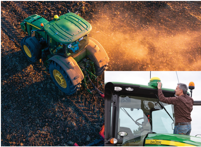
Sensor correction technology lets tractors drive themselves.

Beginning in the 1990s, NASA researchers developed software to correct for Global Positioning Sensor (GPS) signal errors, enabling location accuracy to within inches. John Deere acquired the technology and used it to develop the world's first widely used self-driving farm equipment. Currently, as much as 70 percent of farmland in North America, 50 percent in Europe and South America, and 90 percent in Australia is cultivated by self-driving tractors, many of which still rely on technology originally developed at NASA. [3]