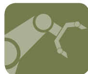
Robotics, Automation and Control