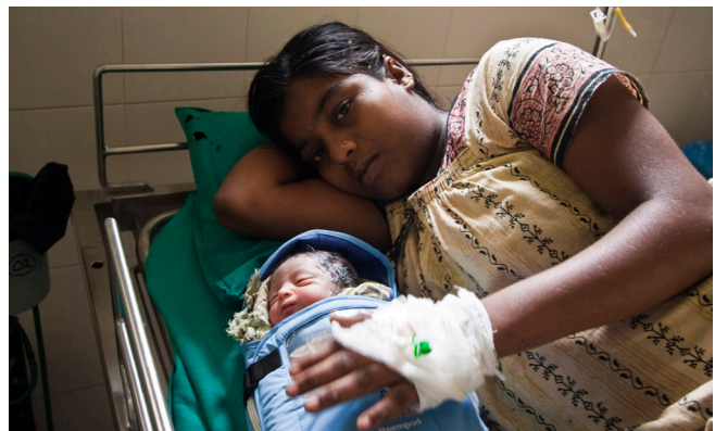
Temperature-regulating fabrics help keep babies comfortable.

One method Johnson Space Center investigated for managing heat inside a spacesuit was the use of phase-change materials. Like ice cubes in a drink, PCMs absorb heat as they change from solid to liquid, and, if exposed to colder temperatures, they release that heat as they refreeze. An SBIR contract led to the creation of fabrics incorporating PCMs, most recently commercialized by San Francisco-based Embrace Innovations in wraps and blankets that help keep babies at an optimal temperature. [6]