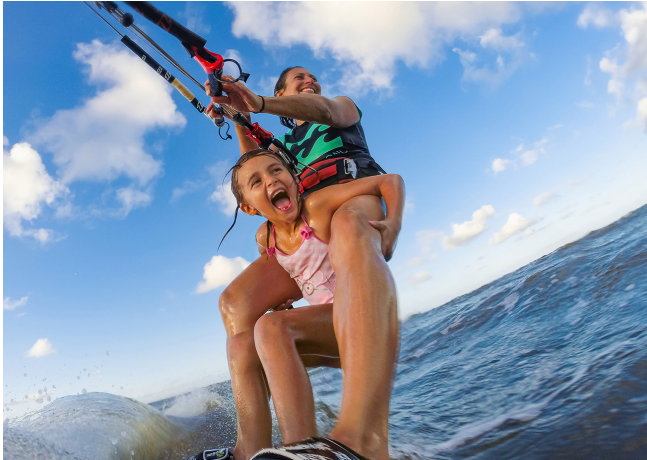
NASA-based semiconductor sensors enable phone cameras.

In the 1990s, Jet Propulsion Laboratory engineer Eric Fossum invented what would become NASA's most ubiquitous spinoff—digital image sensors based on complementary metal oxide semiconductors (CMOS). These were significantly smaller and more efficient than the charge-coupled-device imagers of the day and enabled tiny, battery-friendly cell phone cameras and high-definition video cameras, such as those offered by GoPro, a San Mateo, California-based company. [7]