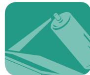
Materials and Coatings