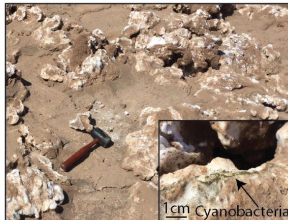
Figure 1: Halite nodules at Salar Grande. Microorganisms that inhabit the interior of nodules are occasionally exposed near nodule crests.

Methods: Visible images at five different spatial resolutions were used to explore the effects of image resolution on a human analyst's ability to recognize and map halite nodules. The images used were collected with a visible light camera (CMOS sensor, f = 2.8 ) onboard a UAV at 10 m flight altitude for a ground sampling distance (GSD) of 0.4 cm/pixel. Images were resampled to 1.7, 6.9, 27.6 cm/pixel