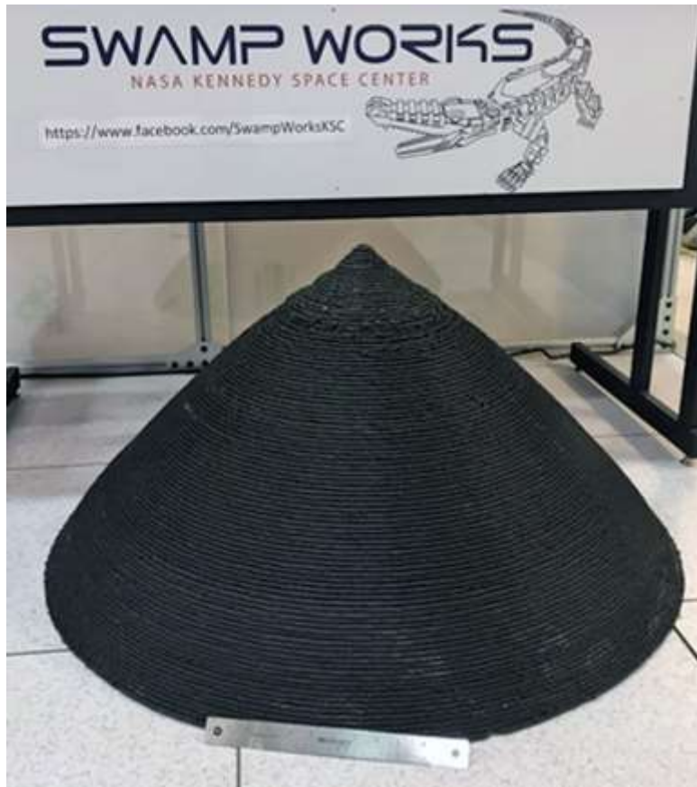
Figure 5. Printed One Meter Diameter Ogive

The ZLM print head project successfully met the KPP. A one meter diameter ogive was printed without any additional support material using feedstock that was at least 70% ISRU derived. The maximum overhang angle of the ogive was 35 degrees from horizontal. It has been shown that flatter overhang angles, including printing horizontally, are possible without support material when using cooling fans. Further development needs to be completed to identify the optimum parameters for horizontal printing and incorporate cooling fan control algorithms. Completion of this development work will enable the printing of a dome and virtually any other part with overhangs.