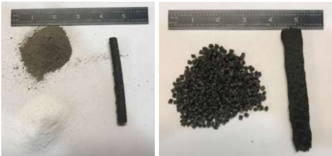
Figure 3. BP-1/HDPE Powders (Left) and Basalt Fibers/PETG Pellets (Right) Feedstocks and Typical ZLM Print Head Extrusions

using polymer concrete composite materials. The ZLM print head uses two types of materials for printing, one is a mixture of BP-1 regolith simulant and High Density Polyethylene (HDPE) powders. The other is pelletized basalt glass fibers and Polyethylene Terephthalate Glycol (PETG). Initially, the team focused on BP-1 and HDPE powder because regolith is readily available on planetary surfaces and HDPE can be synthesized from resources in space (especially Mars) using the Fischer-Tropsch method or re-cycled from available mission materials such as packaging. Eventually the project refocused on the use of the PETG/basalt glass fiber pellets because of numerous advantages including better material properties and processing characteristics. Additional information on the benefits of pelletized basalt glass fibers and PETG is provided in the lessons learned section of this paper.