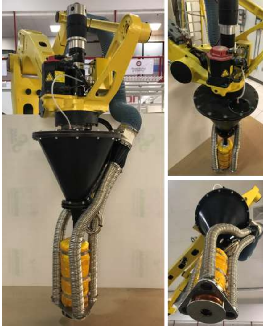
Figure 2. ZLM Print Head

conical section of the hopper has a bolted interface with the upper plate and was designed at a 65 degree slope angle which is greater than the angle of repose for the primary raw material, BP-1. The lower portion of the hopper interfaces with the barrel via a bolt hole pattern.