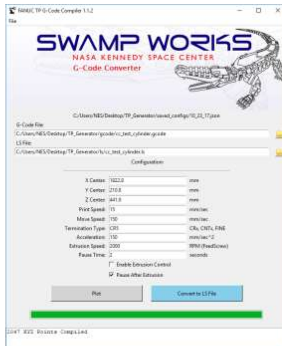
Figure 4. FANUC TP G-Code Compiler GUI