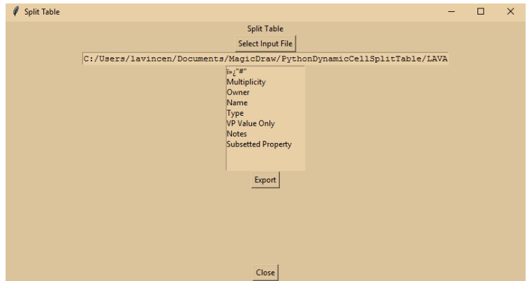
Figure 2. Split Table Program. This is the GUI for the Split Table program written in Python

An area that VTL struggles in is performing complex algorithms and manipulation of data values. To help support this struggle, I wrote supplementary scripts using Javascript that the VTL code could call and execute. The javascript helped me perform string manipulations in order to pull images from the internet to be inserted into