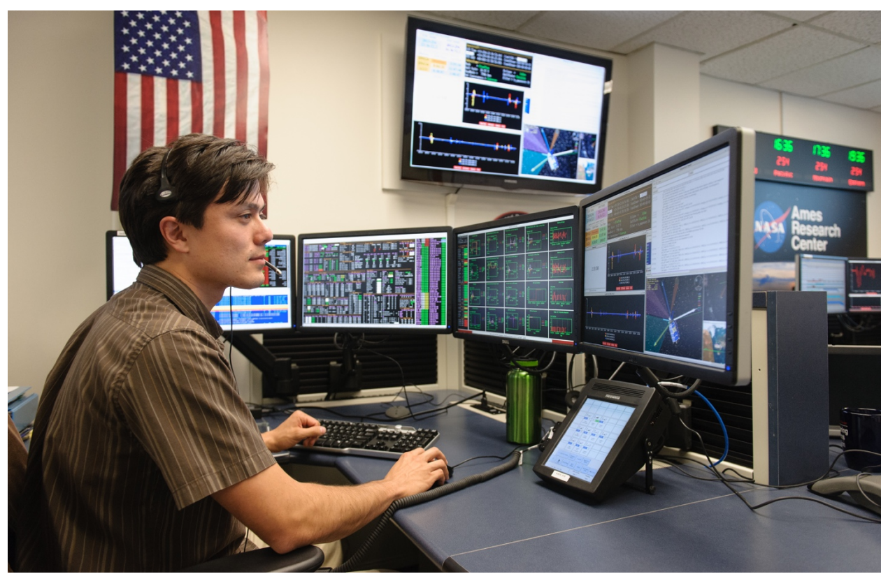
Fig. 1 MMOC Control Center

Multi-Mission Operations Center (MMOC) was created with the goal of increasing the efficiency of mission support activities and reducing the over-all cost of that support. The MMOC provides the facilities, networks, information technology equipment, software, and system administration services needed by flight projects to perform mission functions and relieves the missions of the burden of procuring and provisioning those things themselves. Because of the diverse nature of the spaceflight missions operating at NASA Ames, the MMOC is challenged to meet the needs of projects that vary in size, complexity and purpose. In this paper, we will describe how we designed and implemented a network architecture to support these disparate mission characteristics and how we structured and manage our information system security plan to document each mission's unique requirements, without becoming unwieldy or expensive.