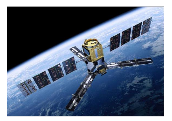
Fig. 1b. Large 2-D Aperture Synthesis Antenna (SMOS example)

Although these efforts are focused on achieving the best path forward for a future high resolution L-band (1.2-1.4 GHz) mission (both ocean and land surface), the antenna technology trade results are also applicable to other low microwave frequencies and could help define the best approach for multi-frequency missions