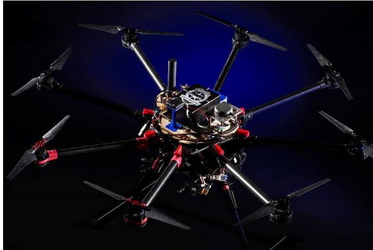
Fig. 1 Current Safeguard Prototype.

Safeguard is designed to monitor and enforce conformance to a set of rules defined prior to flight (e.g., geo-limits and altitude constraints) for small to midsize drones. Safeguard is an independent system (i.e., not embedded with the autopilot or any other system) designed to be easily ported to virtually any drone: home-built, hobby, or commercial. Figure 1 shows the current version of the system installed atop a multi-rotor vehicle.