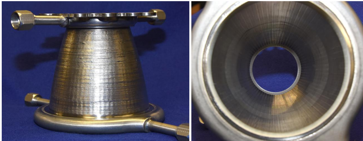
Figure 1. Nozzle #2, Inco 625 Fabrication and Closeout.

The pulsed-arc deposition process provides some advantages with high material deposition rates (20+ lbs/hour) and also interim cleaning for surface oxides. The wire is pulsed at a frequency of XX hz with alternating pulses to clean oxides and deposit metal droplets. The voltage can also be varied real-time to further produce a uniform and clean deposition (weld). The preform components, such as the nozzle liner, are fabricated in several passes wide and varying offsets within pass as height is built to reduce porosity. A build strategy is developed that optimizes density of material and optimizes mechanical properties. A build plate is used for the base of the part to allow a ground. The pulsed-arc process does introduce significant heat into the part during the build so proper stock must be added to allow for distortion or shrinkage during processing. A stress relief is often necessary after the build and other thermal processing to help improve grain structure and associated properties.