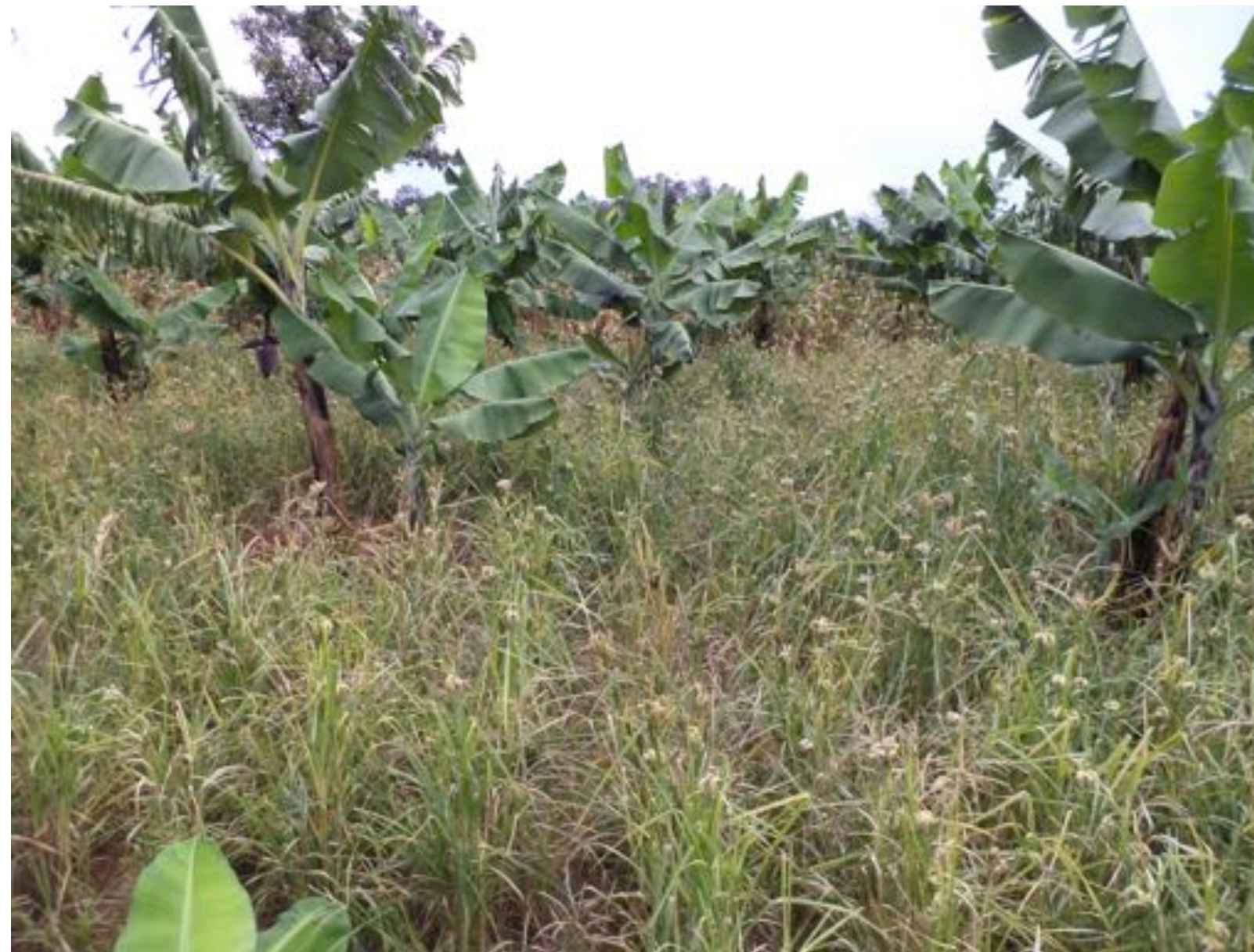
Fig. 2: Bananas and finger millet field in Bungoma, Kenya (Field data collection, 2016)