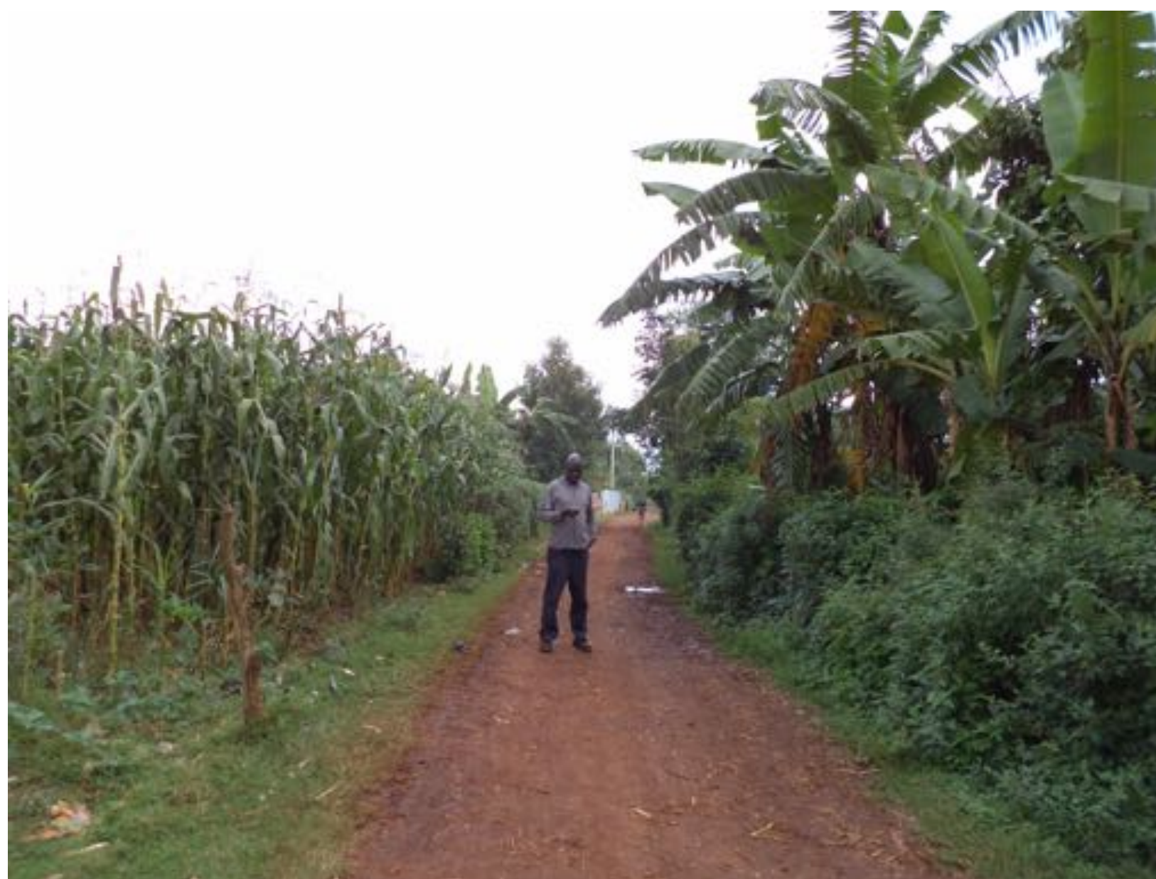
Fig. 3: Maize and banana plantations in Kakamega, Kenya (Field data collection, 2016)