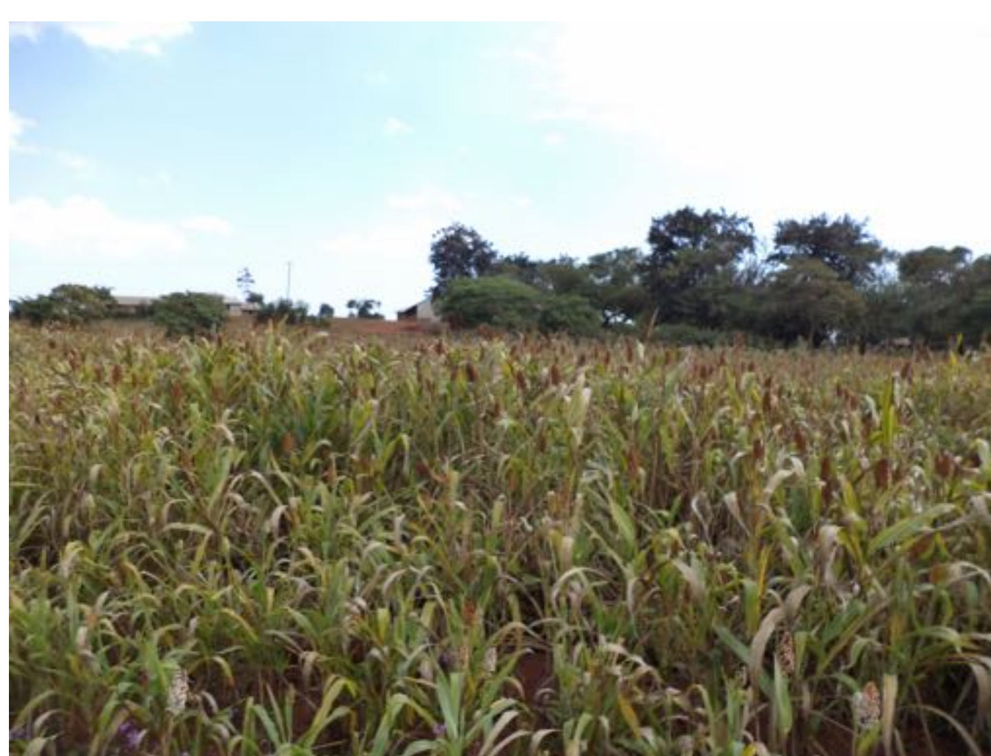
Fig. 5: Sorghum field in Busia, Kenya (Field data collection, 2016)