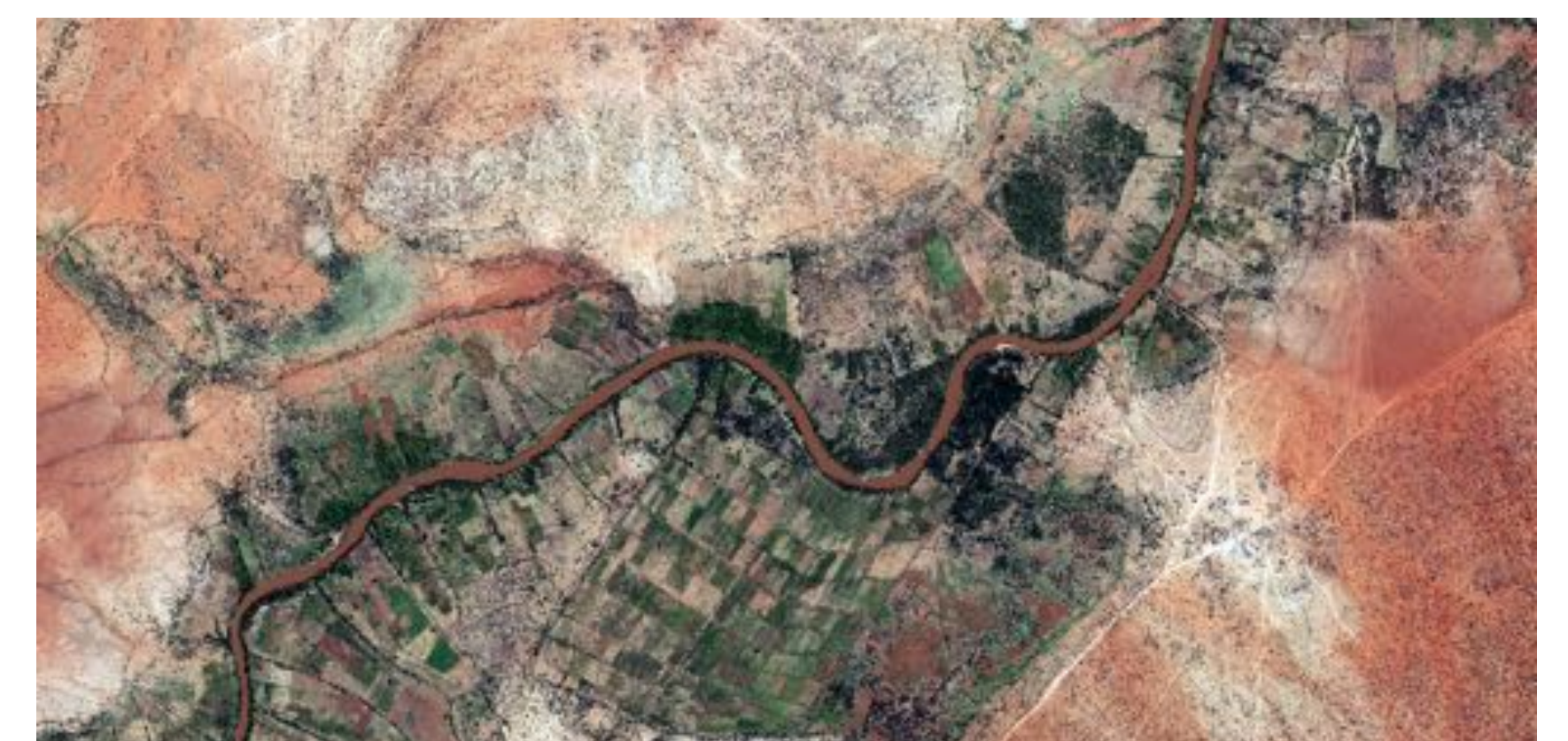
Fig. 7: Cultivated fields along Daua River in Mandera, Kenya. GeoEye1 Satellite Image