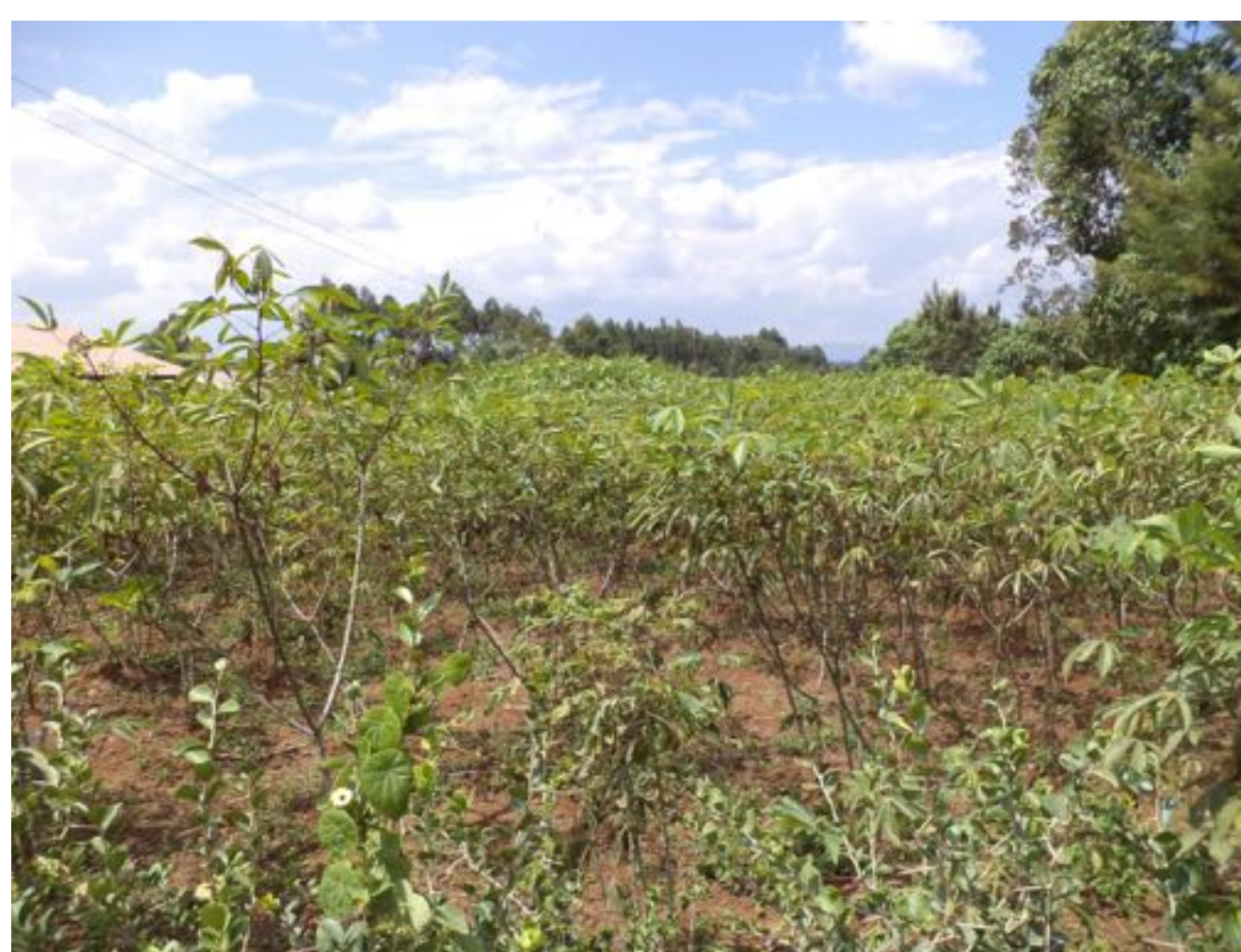
Fig. 4: Cassava field in Kakamega, Kenya (Field data collection, 2016)