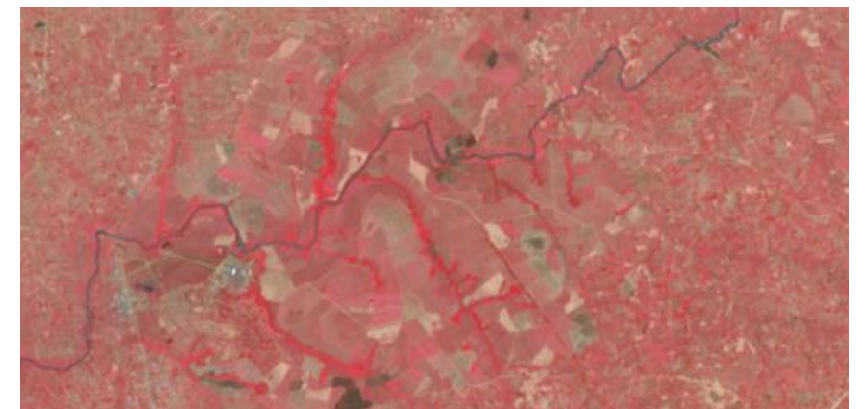
Fig. 6: Sugarcane plantation along River Nzoia in Mumias, Kenya. Landsat 8 Satellite Image