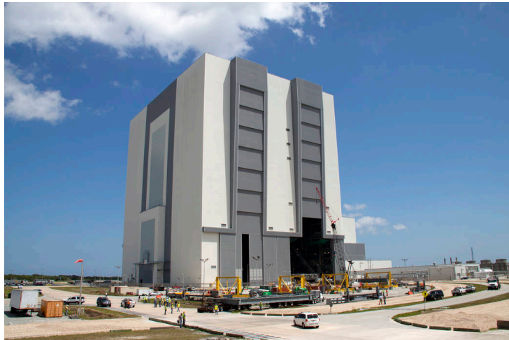
Figure 1: Vehicle Assembly Building at Kennedy Space Center

The VAB is where the launch vehicle and spacecraft are stacked atop the ML support structure, integrated, and prepared for rollout to the launch pad on the CT.