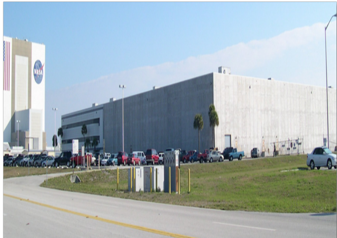
Figure 11: Program Logistics Building

EGS Program Logistics support is what is known as high-variation/low-volume logistics. This means that only a few of one item are procured at a given time, but that requirements exist to procure many different items. This type of support is common to very complex systems, such as ones used for unique operations like launching rockets. Program Logistics can be divided into two main branches: Logistics Engineering and Logistics Operations.