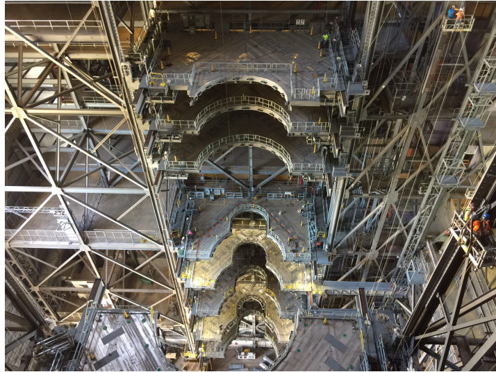
Figure 2: Platforms at VAB

Unanticipated Flexing: One of the biggest surprises the project encountered was the inability to install the first platform because of misalignment of mounting hardware. The platforms were designed with holes drilled to match corresponding holes on the supporting VAB structure. The four pins that should have fit perfectly were problematic, taking hours to finally insert. What was the problem? A dynamic structural response model revealed that while suspended by the crane lowering it into position, the platform was flexing—up to two degrees. This flex or rotation was enough to create a critical misalignment. Solution: the team installed two, 70-foot stiffener beams under each platform, eliminating the dynamic flex in the platform. Subsequent platforms were successfully installed in under 10 minutes.