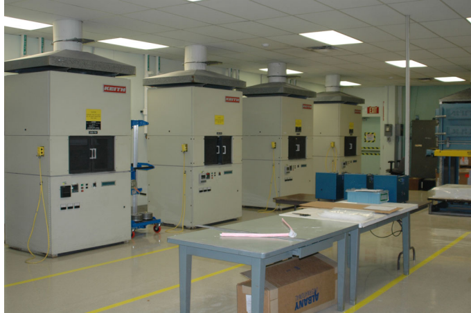
Figure 10: Thermal Protection System Facility (TPSF)

The TPSF manufactures thermal protection systems (TPS) and thermal control systems (TCS) that protect spacecraft on orbit and during reentry. This includes both tile and soft-goods, such as thermal blankets and gap fillers. The facility also manufactures ground support equipment (GSE) as needed. The TPSF is currently supporting both government and commercial customers.