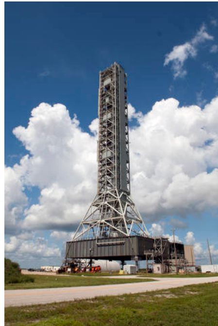
Figure 6: Mobile Launcher

The ML is also host to multiple deployable T-0 umbilical arms that are attached to the launch vehicle during processing in the VAB. At the moment of launch (T-zero), the umbilicals are disconnected and retracted. The umbilicals are designed to provide the services and commodities necessary for safe and efficient stacking and integration of the SLS and Orion, including pneumatics, electrical power, communications, and environmental control purges. After stacking, test, and checkout (leak checks, data checks, and electrical checks) in the VAB, the ML and launch vehicle travel atop the crawler transporter to Pad 39B for final tests, checkout, and launch.