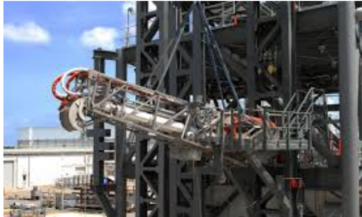
Figure 9: Umbilical Testing at LETF

The LETF is where functional tests are conducted for the structural arms and umbilicals that connect SLS and Orion with the mobile launcher. Some of these umbilicals are massive—two stories high and weighing 65,000 pounds. Aptly named, umbilicals are the launch system life lines providing pneumatic and environmental air commodities, electrical power, telemetry, and communications. Several also flow extremely hazardous cryogenics (LH2 and LO2). Besides providing essential services, the arms are also required to be agile and nimble, disconnecting at T-zero (launch ignition) and then retracting or swinging out of the way.