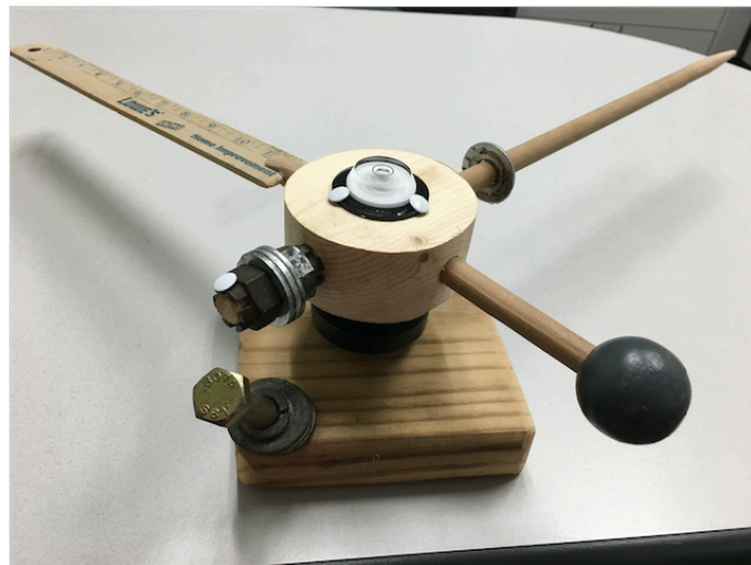
Figure 5: The Four-Way Teeter-Totter balances requirements, costs, schedules, and technical performance

Four-Way Teeter-Totter: Imagine a four-way teeter totter balancing on a post. The project manager lives at that junction and is challenged to maintain a balance between the four arms: (1) design/build activities, (2) operational requirements, (3) resources, including budget, people, and equipment, and (4) schedule. The manager is making risk-balancing decisions that respond to external forces—principally changes in requirements. The interplay between the changing operational requirements and the design/build team is most critical and warrants constant communication. The classic project management failure mode is “requirements creep,” simply absorbing requirement changes without increases in budget and schedule. The four-way teeter totter reinforces proactive management action to balance the risk between the various domains— absorbing schedule hits or re-baselining, pushing back on certain requirements, finding alternative designs, or going after more resources.