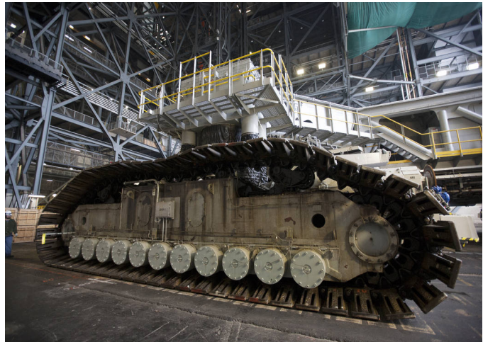
Figure 4: Crawler Transporter

Crawler transporters are designed to lift the mobile launchers with launch vehicles mounted atop, then move the entire integrated stack from the VAB to the launch pad. The crawler transporter, designed in the early 1960s, weighs over 6 million pounds, is as large as a major league infield (90 feet by 90 feet), and has more than 400 shoes, each one weighing over a ton.