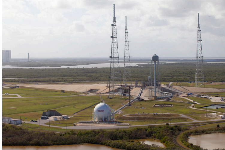
Figure 3: Launch Pad 39B at KSC

The EGS Pad 39B element is overseeing upgrades to Launch Pad 39B and other supporting facilities to support NASA’s deep-space missions, SLS, and Orion as well as the transition to a multi-user spaceport. The Pad 39B element provides not only the structural foundation, but all the supporting systems to supply the ML and the vehicle. As shown in the adjacent photo three lightning protection system (LPS) towers have been constructed, each