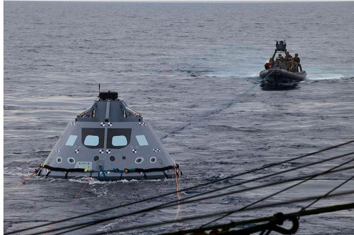
Figure 8: Spacecraft Recovery Test

The Landing and Recovery Project is responsible for the recovery, retrieval, and rescue of the Orion spacecraft. Recovery refers to a nominal (planned) recovery of the crewed Orion off the coast of San Diego. The requirement is to be able to open the crew door within two hours after splashdown. Retrieval refers to recovery of an uncrewed capsule at an unplanned landing site. Rescue refers to recovery of the flight crew after an abort in the Atlantic or Indian Ocean.