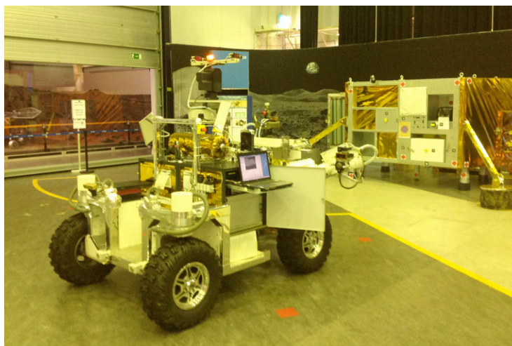
Figure 2. Eurobot and lunar lander in High Bay.

In OPSCOM-2, validation of key DTN features for telerobotics, such as custody transfer and full-duplex DTN communication will be performed. The experiment will demonstrate the benefits of DTN, including reliable data transfer, automatic “Loss of Signal” (LOS) handling, efficient bandwidth use, and the automatic routing of the data packets if more than one communication path is available.