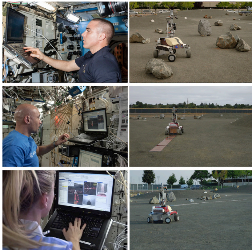
Figure 4. Surface Telerobotics testing. Top: site survey; middle: deployment of a simulated lunar telescope antenna; bottom: inspection of deployed simulated lunar telescope antenna.

To focus our work, we designed Surface Telerobotics to simulate a possible human exploration mission involving the Orion Multi-Purpose Crew Vehicle (MPCV). One leading concept, the “Orion MPCV L2-Farside” mission, proposes to send a crewed MPCV to the L2 Earth-Moon Lagrange point, where the combined gravity of the Earth and Moon allows a spacecraft to easily maintain a stationary orbit over the lunar far side [3]. From L2, an astronaut would remotely operate a robot to deploy a polyimide film-based radio telescope.