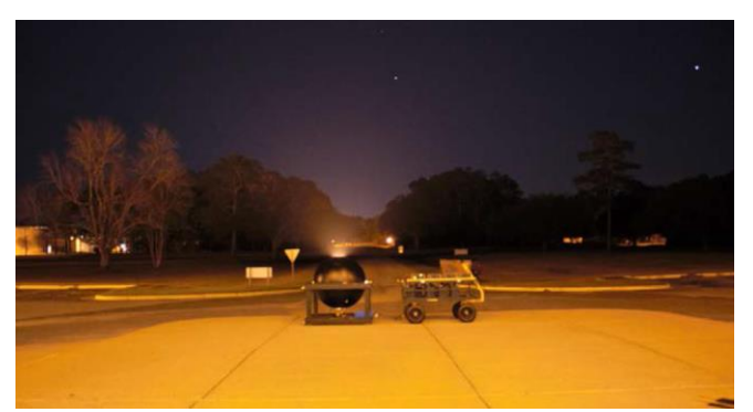
Figure 3. Initial deployment of Ground-based Accurate Active Light Source (AALS) for radiometric calibration of the VIIRS DNB's High Gain Stage.

Initial assessment activities are aimed at evaluating NASA's Black Marble product suite at several locations and time periods, representing different retrieval conditions and assessing the uncertainty of seasonal effects due to vegetation seasonality and snow cover, temporal aggregation, and the impacts of these effects on datasets and products that are directly called for by GEO's Work Programme. This also includes end-to-end analyses of downstream product impacts, due to sources of measurement error in the nighttime lights data, to help expose discrepancies that affect GPW4 (Gridded Population of the World version 4) estimates [26], as well as other datasets produced from additional demographic and mobility layers, e.g., the American Community Survey (ACS), and the Puerto Rico Community Survey (PRCS). These datasets, which are currently provisioned by team members at NASA's Socioeconomic Data and Applications Center (SEDAC), also as part of GEO's Work Programme, must be thoroughly assessed to generate accurate estimates of populations at high frequency time intervals [27].