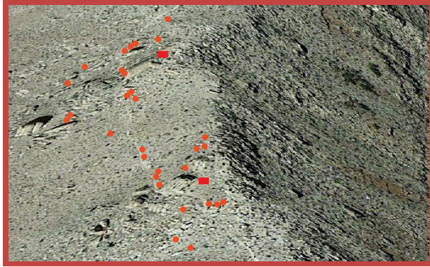
Figure 3. Locations of ejected Moenkopi blocks (orange points) and impact melt particles (red rectangles) topographically above Moenkopi bedrock in the crater wall (burgundy strata on right). Additional fragments of Moenkopi occur on the ejecta blanket farther to the left and were likely transported downslope by erosion of fallback ejecta. West crater rim in the vicinity of Whale Rock (far left), looking obliquely south to north.

bab, contains 1.5 to 23% Moenkopi, and contains only rare Coconino. A drift survey across the surface of the area located two fragments of vesicular impact melt (clearly distinguishable from volcanic detritus that contaminates the crater region) within a few meters ( Fig. 3 ) of the crater rim crest.