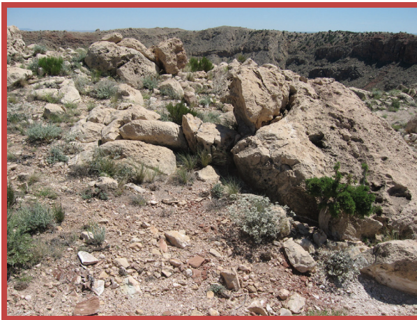
Figure 1. Fragments of red Moenkopi siltstone (foreground), from the uppermost impact target unit and a proxy for fallback ejecta, are located among Kaibab boulders near the summit of the crater rim. From [7].

Relics of that type of material began to emerge ( Fig. 1 ) in a new mapping effort. In a series of NASA-sponsored student training and research programs, fallback material and related ejecta mechanics are being systematically documented [3-8]. Here, we present the latest results, which indicate traces of fallback breccia survive on the crater rim.