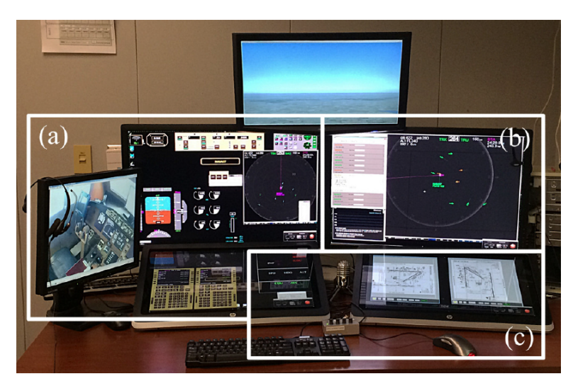
Figure 3. SPO III Dispatch Ground Station: (a) flight deck displays for the selected aircraft; (b) TSD, ACL with ELP recommendations; and (c) CRM tools and sharable charts.

ed assistance") without prior exposure to either the flight or other environmental conditions such as the weather.