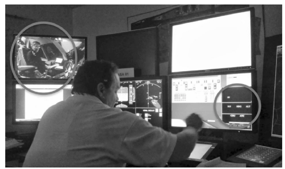
Figure 2: SPO II Ground Station. CRM indicators circled on the right and video of the cockpit circled on the left.