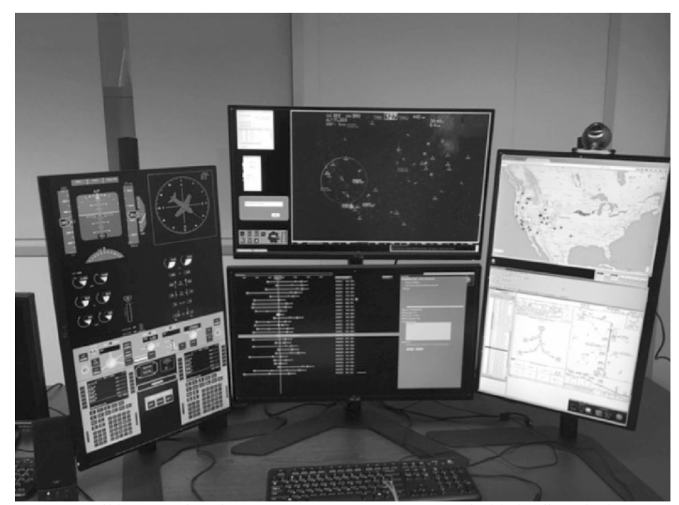
Figure 4. Build 1 Ground Station. Bottom center, ACL, augmented with timeline, alerting information; above the ACL is the TSD; to the left is flight controls and displays for the selected aircraft in read-only mode; on the right is CONUS map and charts.

ous sources (e.g., monitoring weather data, ATC clearances, aircraft position, and EICAS alerts) and placed prioritized alerts on a redesigned ACL when threats were detected (see Figure 4)[5]. The route replanning tool, presented to the left of the TSD, used in Experiment 3 was augmented to display ATIS at the destination airport as well as indicate which of a number of risk factors were present in any potential divert location [12] [13]. Operators could request ratings for airports that were not recommended by the tool and could adjust the weighting of various factors going into the recommendation. The modified tool was renamed the Autonomous Constrained Flight Planner, ACFP. Five certified dispatchers and five commercial airline pilots participated in the build one evaluation. Participants ran two one hour-long scenarios. Each scenario required participants to make approximately six diversions using the ground station tools.