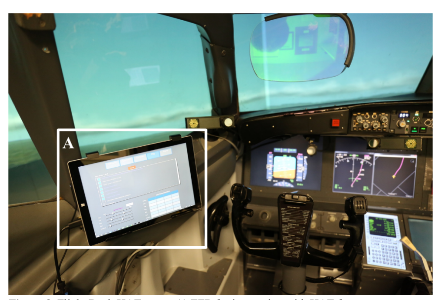
Figure 8. Flight Deck HAT setup: A) EFB for interacting with HAT features.

Since the ground dispatch and the onboard captain share responsibility for the safety and efficiency of the flight and both must consent on any flight deviations, a clear next step was to install the HAT tools on the flight deck. So in the final study, we integrated the ACFP, AMMS, and playbook paradigm into an electronic flight bag (EFB) and installed it on the flight deck (see Figure 8). Twelve airline transport pilots participated in our flight deck assessment of HAT tools which were presented on an EFB. Each pilot flew three off-nominal, 15 minute scenarios in both the HAT and no HAT conditions. In each condition scenario difficulty varied – high, medium and low.