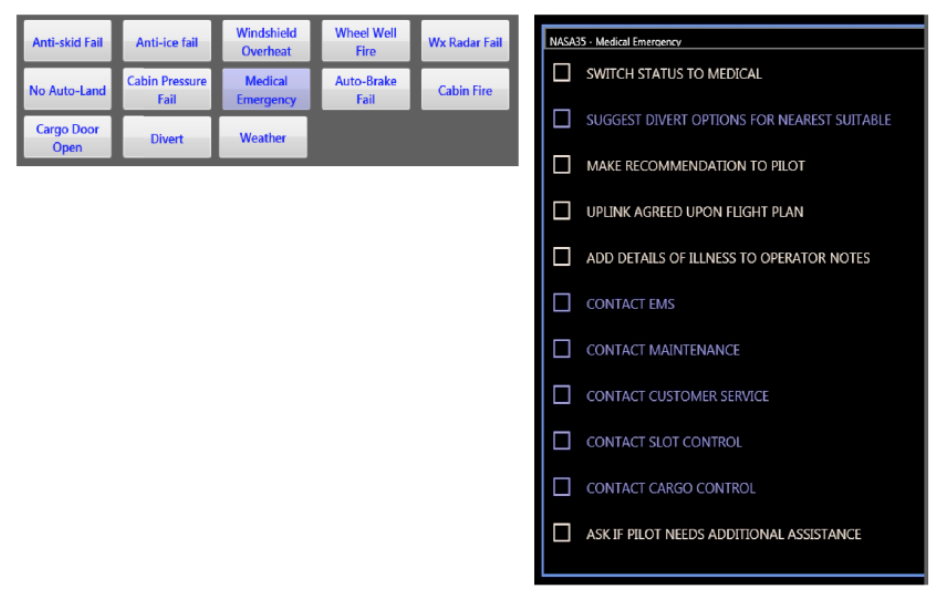
Figure 6. Operator Directed Interface for calling plays in the HAT condition and associated checklist of roles and responsibilities.

For Bi-Directional Communication, weights were preset for each play and presented in slider bars (top of Figure 7). The operator was able to negotiate with the system by altering these weights to what the operator considered appropriate for the situation. The operator can perform "what if exploration" by changing the weights to see how the divert recommendations are affected. Using the example shown in Figure 7, if the operator decided that estimated time of arrival (ETA) to the airport was a higher priority than available services, the operator could adjust the ACFP weights and find new recommendations.