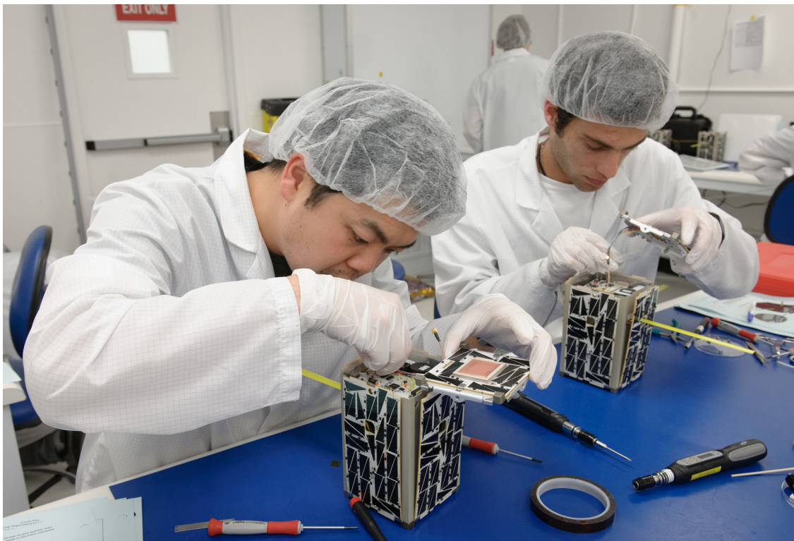
Nodes Spacecraft Assembly Sequence