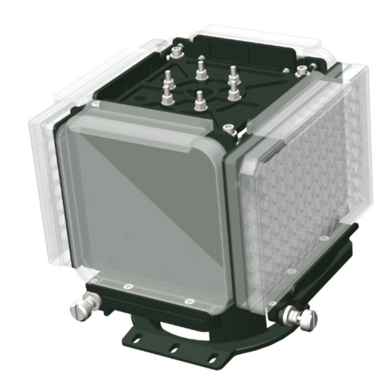
Enlarged filter wheel containing 9 emission filters and 1 clear filter for color imaging.