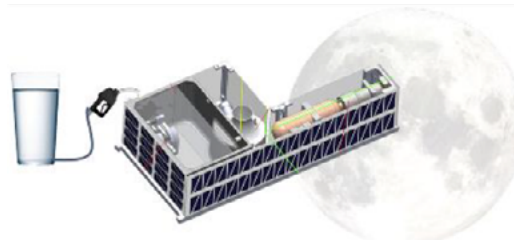
Cislunar Explorers 6U-sized CubeSat splits into two; each uses water for its propellant.

The three EM-1 launch winners are: Cislunar Explorers, CU-E3, and Team Miles.