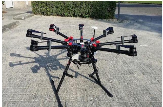
Figure 2: DJI S1000

Even the sUAS (under 55 pounds) varies significantly in size and weight. In order to study MIMO configurations, we first need to specify the size of the sUAS under consideration. Figure 2 shows the sUAS used in NASA's UTM project [12]. This vehicle has a 40A electronic speed controller (ESC) built in to each arm in an octocopter configuration. The high performance 1552 folding propeller has a size of 15×5.2 inch.