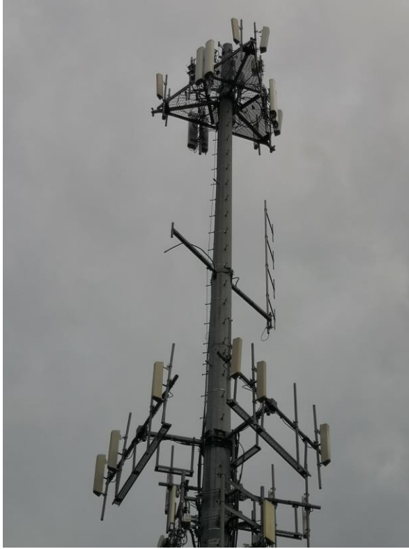
Figure 3: Base Station with Sector Antennas

MIMO Configuration A: We first propose three sectors with 120 degree per sector. For each sector, there are 4 sector antennas, so overall there are 12 directional antennas. It is worth noting that: (1) the sUAS only needs 4 independent RF chains because at any given time only one sector communicates with the serving BS. However, each sector antenna in the BS has an independent RF chain because the BS has to simultaneously communicate with AUE and TUE from different sectors. (2) the 3-sector with 4-antenna per sector is the practical configuration in many BSs. Since the spatial DoF of MIMO channel is essentially determined by the minimum of m and n , the 3-sector with 4-antenna per sector setting for sUAS matches that of the BS and thus can fully realize the potential of MIMO.