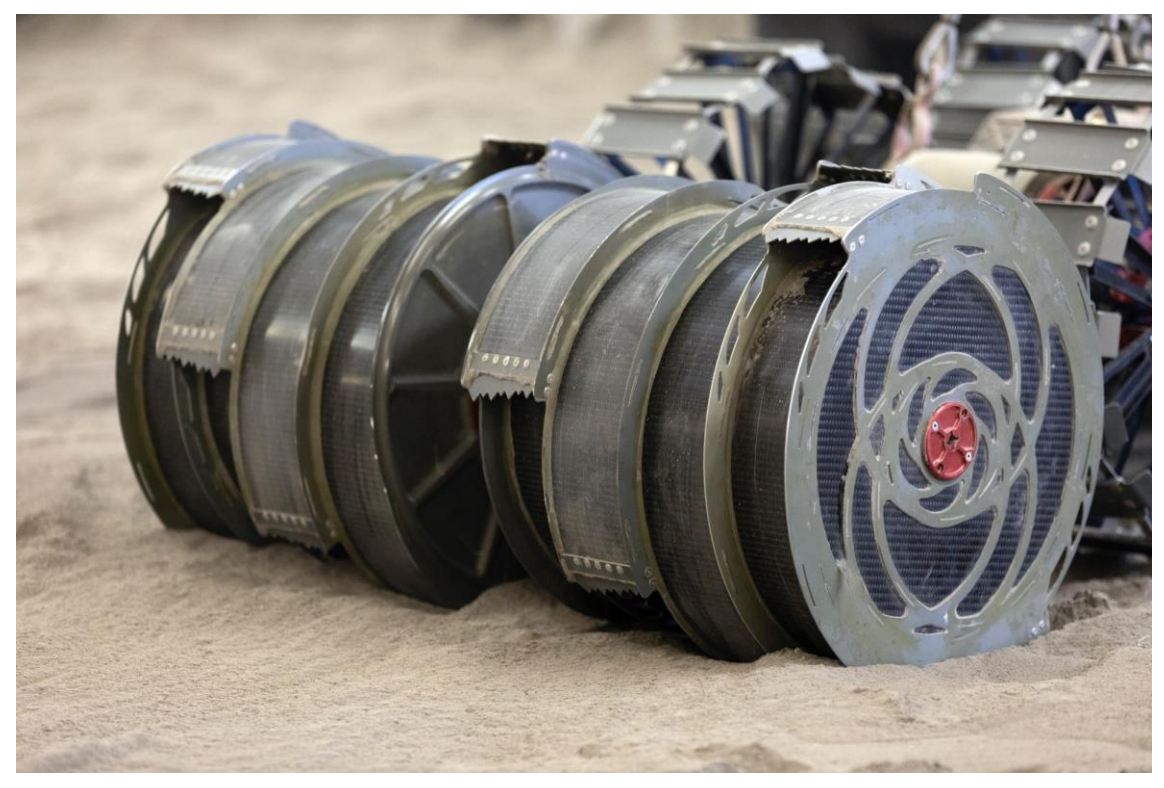
Fig 2: RASSOR bucket drums (4)

I feel as though my experience at KSC has been enriching in many different ways. I have learned a lot about myself and what I should expect from a future career. I think the most important thing I've learned is that for my career I'd like to work somewhere that allows me the creative freedom that I experienced at KSC. I always felt as if there were no limits to the ways that I could solve a problem and I was always encouraged to use as many available resources as possible to complete a task. Working at KSC has also taught me that central Florida may not be my preferred location of residence which is very difficult for me because I would like very much to work for KSC when I graduate this upcoming school year. My experience has allowed me to further evaluate what matters the most to me when picking a career path.