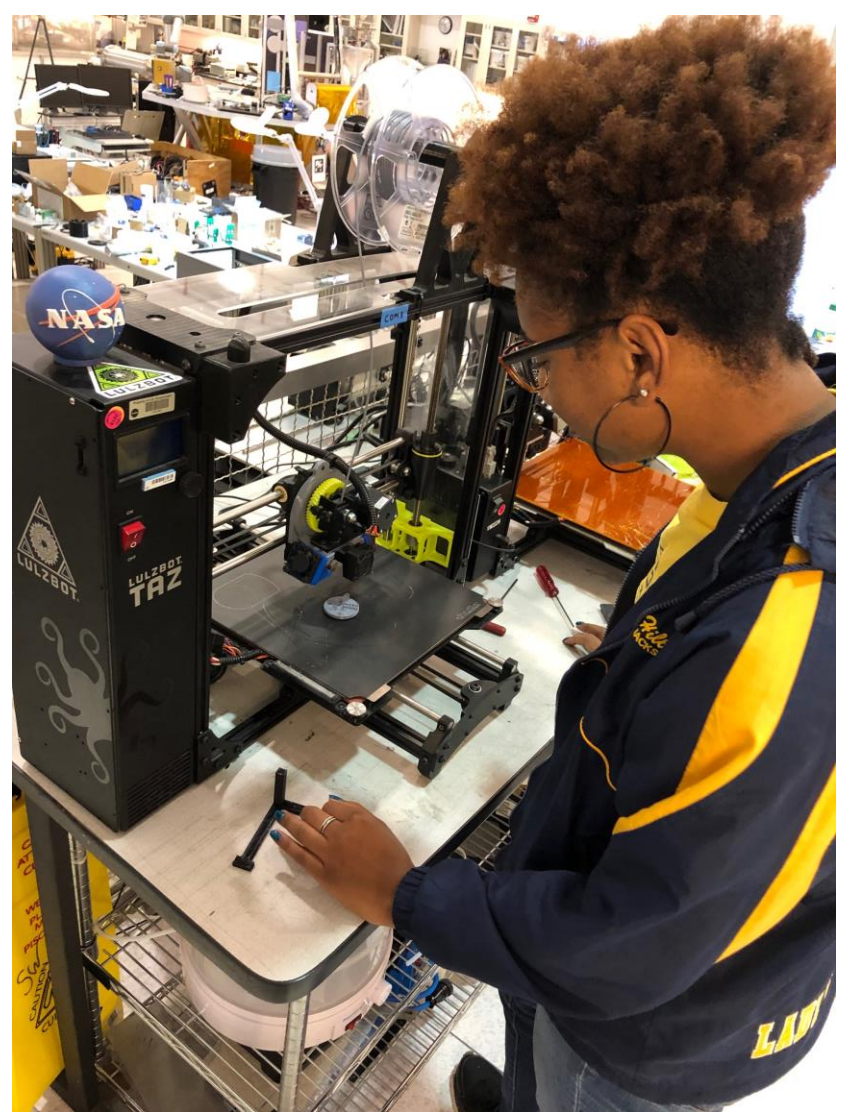
Fig 4: Another component of my project was rapid prototyping using 3D printing technologies. (5)