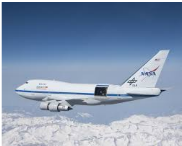
Figure 1: The Stratospheric Observatory for Infrared Astronomy (SOFIA).

We present the first observation of Titan with the high-resolution Echelon cross-Echelle Spectrograph (EXES) instrument on the Stratospheric Observatory for Infrared Astronomy (SOFIA, Fig. 1). These show clear detection of multiple spectral lines in the R-branch of the acetylene vibrational band at 13\ \mu\text{m} . These are compared to similar observations with the ground-based sister instrument TEXES (Texas Echelon cross-Echelle Spectrograph) on the IRTF (Infrared Telescope Facility), showing that EXES will have access to an enlarged spectral range as expected, through reduced atmospheric opacity. In future EXES will be used to complement TEXES for spectral line searches on Titan, geared to detect new molecular species, focusing on spectral regions that are inaccessible from the ground.