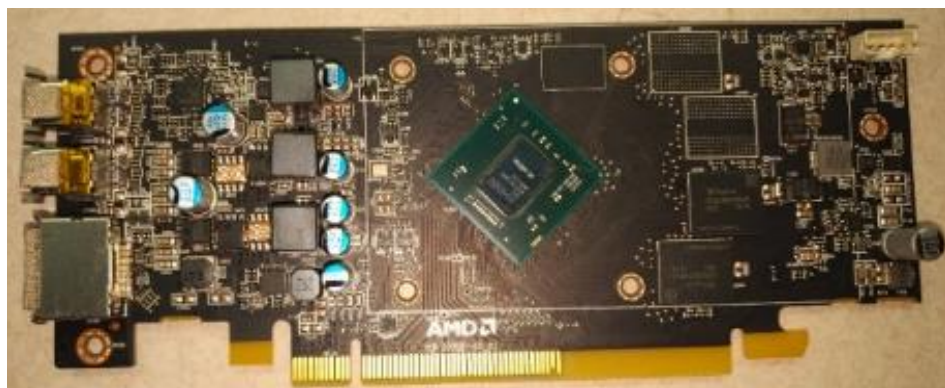
Figure 2: AMD e9173 GPU as-tested

The AMD e9173 GPU is a graphic coprocessor for use in a modern commercial off the shelf (COTS) computer. It was cannibalized from a Dell Wyse 5070 thin client computer. The carrier board is connected to the computer motherboard via a PCI-e x16 slot. The GPU die, itself, is the device under test (DUT) and is located underneath the unit's heat sink. Figure 1 shows pictures of the graphics card without its heatsink. Table 1 gives information on this part.