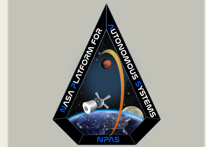
NASA Platform for Autonomous Systems

A primary goal of the current NPAS project is to integrate with other Advanced Exploration Systems (AES)/HEOMD projects at Johnson Space Center's (JSC's) Integrated Power Avionics and Software (iPAS) "habitat" test article. NPAS was used to demonstrate a deep space autonomous habitat operation, exhibiting integrated hierarchical distributed autonomy capability, encompassing 3 autonomous systems (vehicle manager, power, and avionics). The demonstration addressed autonomous nominal and off-nominal operations and responses taken jointly by multiple subsystems to mitigate anomaly effects (from flight computers and the power system) on the mission objectives. NPAS was also used to develop graphical user interfaces (GUI's) for autonomy and shared-autonomy operations. Each NPAS application ran from a networked