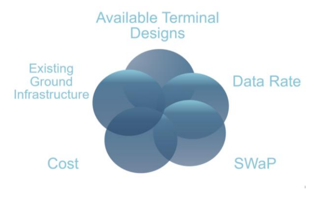
Fig. 4. Key Trade Considerations

Early in the study effort, the team explored and identified several areas and considerations that would be considered a trade study or a constraint to the trade space. In general terms, the primary trade categories explored are as follows: