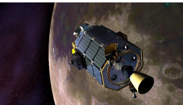
Fig. 2. NASA's Lunar Laser Communications Demonstration (LLCD)