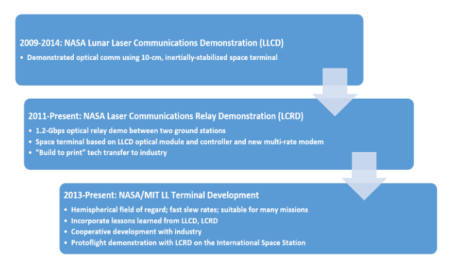
Fig. 1. Optical Communications Technology Progression

Another primary step was determining what existing technologies could be used to base the mission's OCP off of. Much of the technology being targeted for use on the mission's OCP is traceable to the Orion Artemis-2 Optical Communications System (O2O). O2O will leverage optical communications technology for use on the Orion Multi-Purpose Crew Vehicle. The terminal will enable live, 4K ultra-high-definition video from the Moon. The type of optical communications terminal being used by O2O is being developed by the Massachusetts Institute of Technology's Lincoln Laboratory (MIT LL) and industry partners. The progression of the technology leading up to the terminal design is shown below: