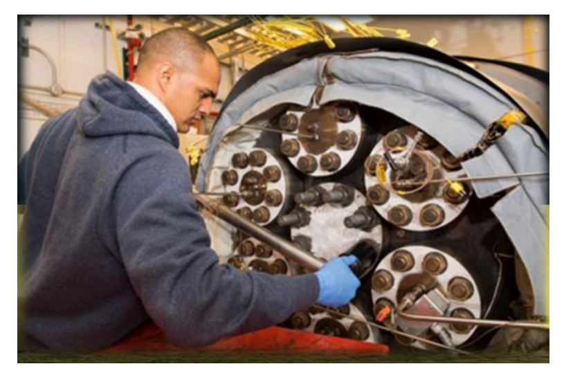
Figure 3. Testing in GEER at Venus surface conditions

Recent work has notably expanded capabilities and produced the world's first microcircuits of moderate complexity (Medium Scale Integration).