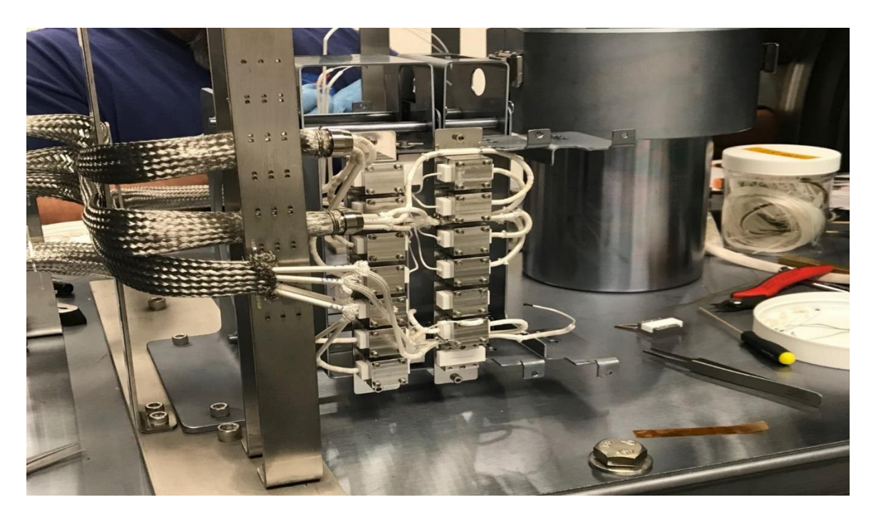
Figure 1 Recent test setup of LLISSE components in GEER

Structure, interconnections, and other aspects such as material selections also continue to make progress. Figure 1 shows a recent setup in a simulation chamber at NASA Glenn known as GEER (Glenn Extreme Environment Rig). This activity was undertaken to test how the GEER system interacts with the varying components and how the components interact with each other. The ongoing work is building up to a full system level demonstration in the coming months.