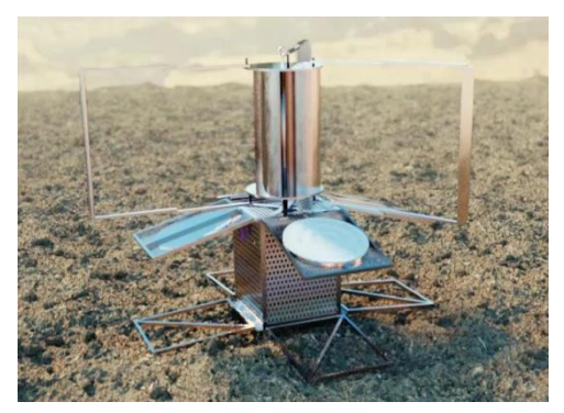
Figure 2. Early concept of potential wind powered version of LLISSE

These sensors will take measurements periodically (currently assumed to be every 8 hours). However, for the final flight version, timing of measurements will be determined in coordination with orbiter LLISSE communicates to. LLISSE life