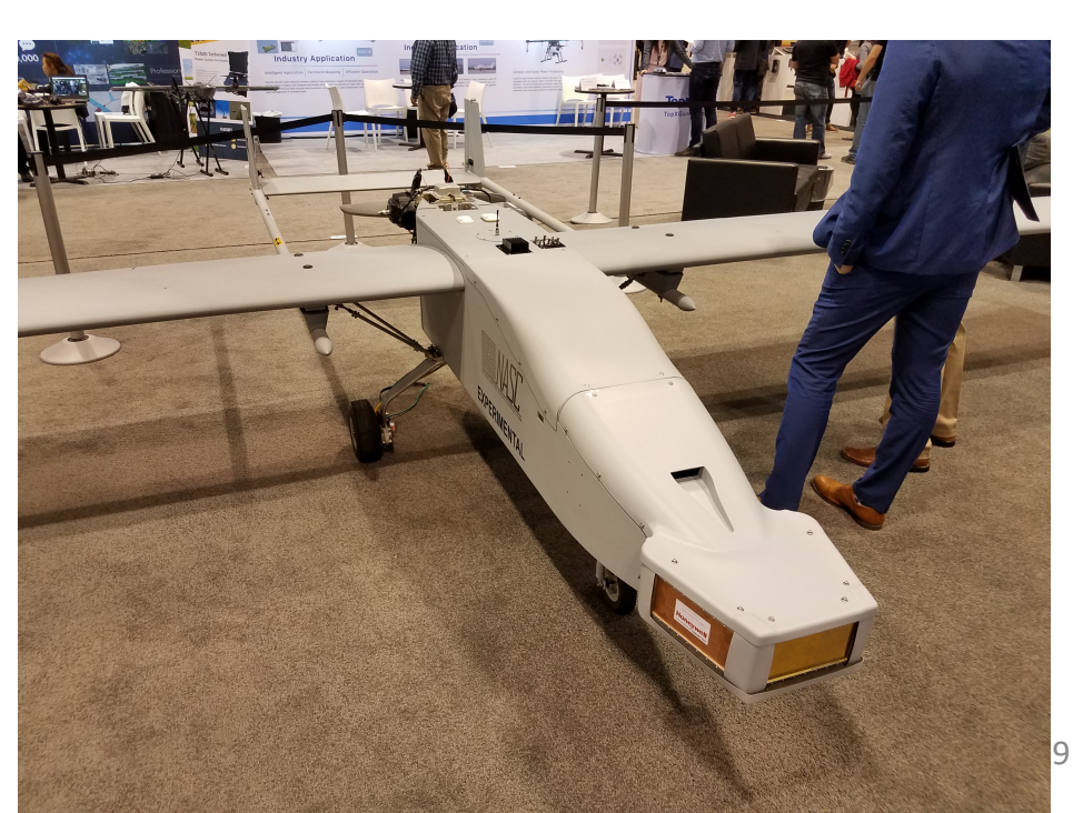
Tiger Shark with Honeywell RADAR Panels