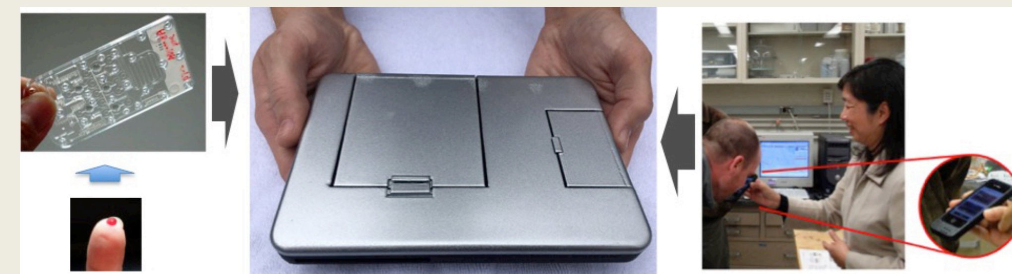
NASA-LLNL Medical “Tricorder”