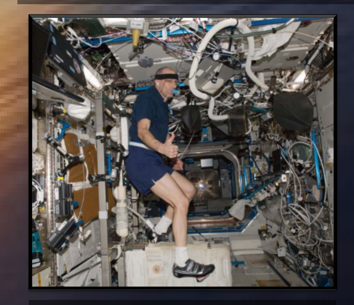
Figure 2. In-flight VO<sub>2</sub>pk test using the Portable Pulmonary Function System (PPFS) and CEVIS.

Figure 1. Battery of muscle strength and size tests. From left to right: A, B, C, & D) Battery of strength tests used to assess upper and lower body muscle performance measures of maximal isometric force, peak power, total work, and fatigue index; E) MRI image used to calculate muscle cross sectional area; F & G) Ultrasound image acquisition used to measure muscle thickness.